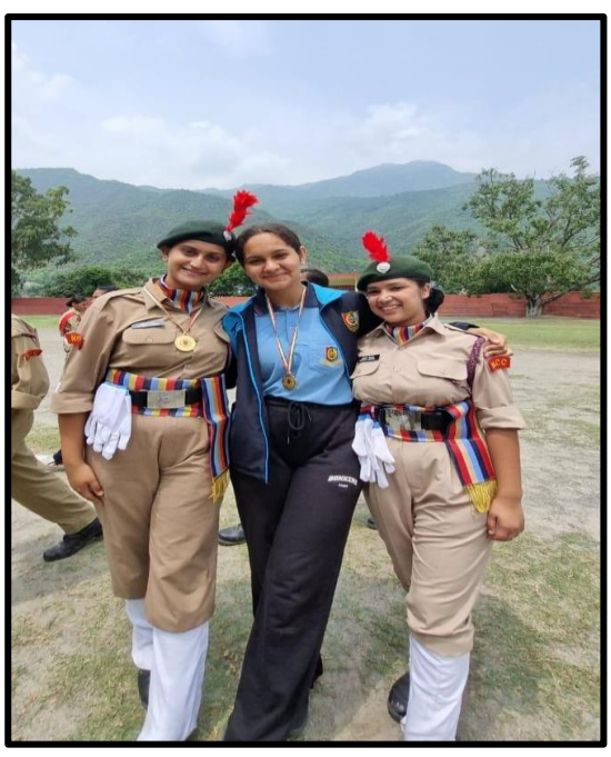
Cadets during the Camp