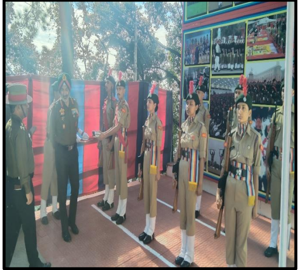
ADG Sir meeting the Cadets