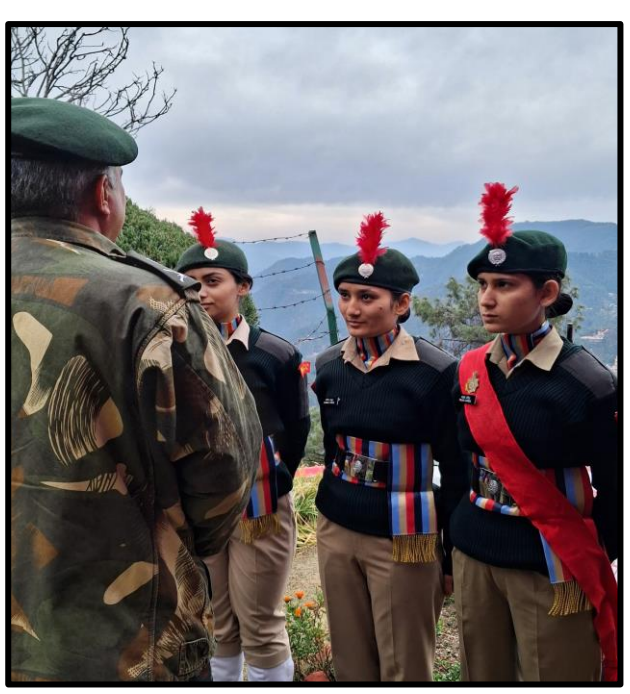
Cadets during the ADG Visit