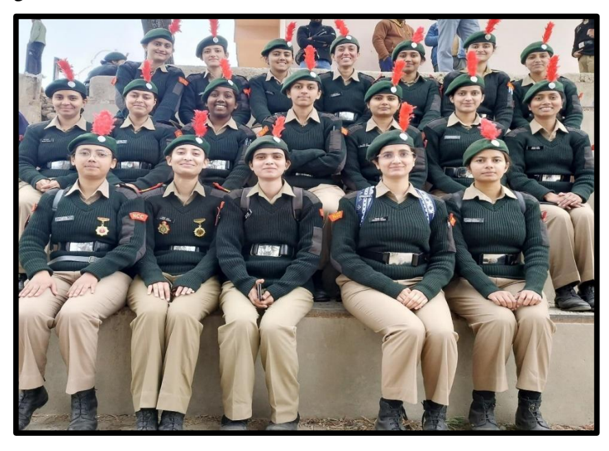
Cadets after the CEE Certificate Exam

The cadets demonstrated exceptional discipline and commitment while undergoing rigorous practical and theoretical assessments conducted by experienced examiners. Their ability to execute synchronized drill movements, navigate complex terrains using maps, and handle weapons with precision was thoroughly tested. This examination not only evaluated their technical and tactical knowledge but also reinforced their leadership, teamwork, and decision-making abilities.