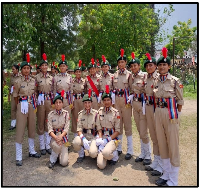
Cadets during the Camp