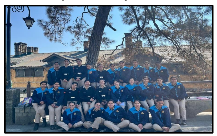
Cadets after the BEE Certificate Exam

On February 1<sup>st</sup>, 2025, the IInd Year, NCC cadets of St. Bede's College under 7 HP (I) Coy NCC Shimla underwent the NCC Practical Examination held at Rajiv Gandhi Government College, Shimla. The exam encompassed various components such as drill test, field craft and battle craft, map reading, weapon training and communication. The practical exam concluded with an interview session conducted by the Commanding Officer of 7 HP (I) Coy NCC Shimla. On February 2<sup>nd</sup>, 2025 the cadets sat for the written examination for the BEE certificate at Rajiv Gandhi Government College, Shimla, further demonstrating their dedication to their NCC training and certification process.