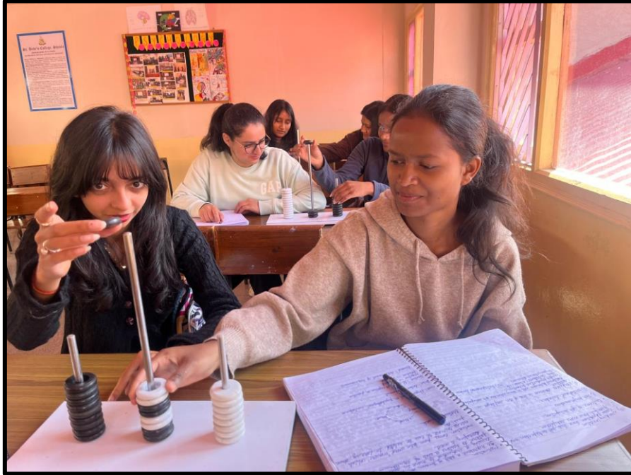
Students using McDougal Disc Apparatus (Psychology)