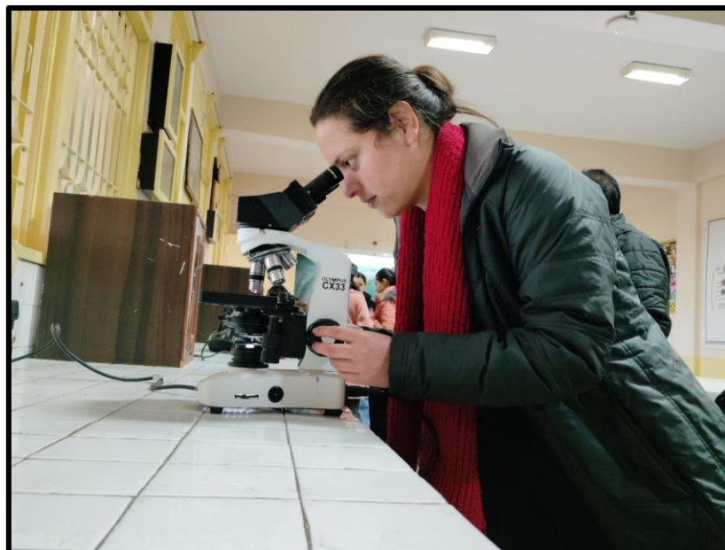
Microscope setting for visualizing slide(Zoology )