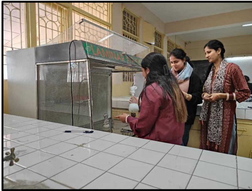
Laminar air flow (Botany)