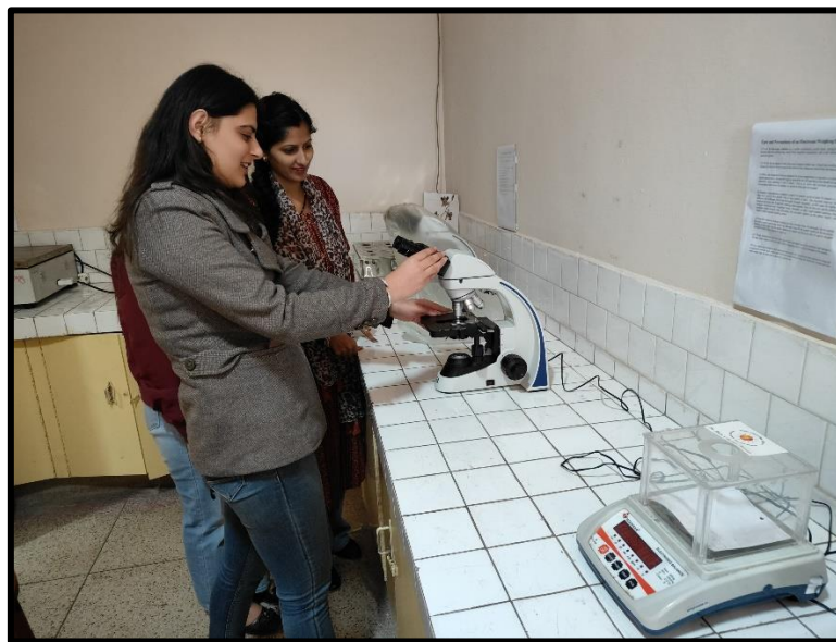
Binocular light microscope (Botany)