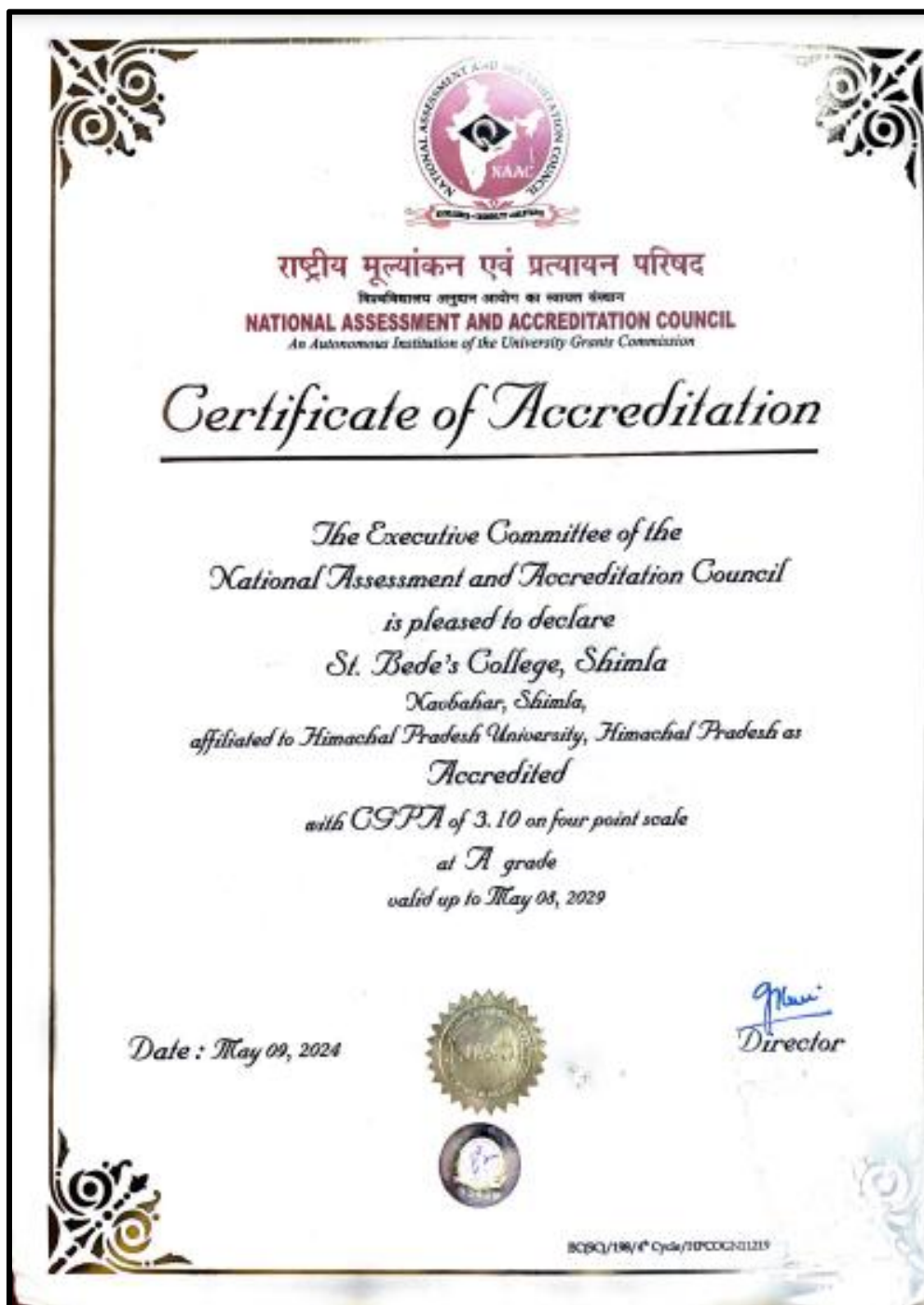
NAAC Accreditation Certificate