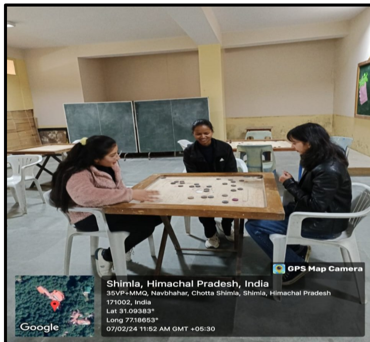
Students Playing Indoor Games in the Common Room