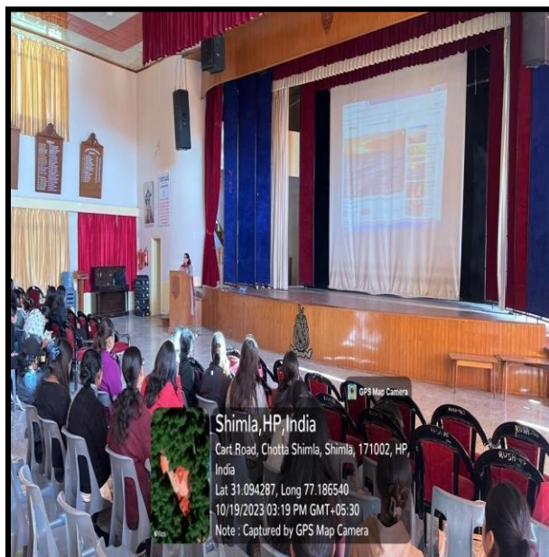
Session on the Importance of Counselling in Student's Life (October 19, 2023)