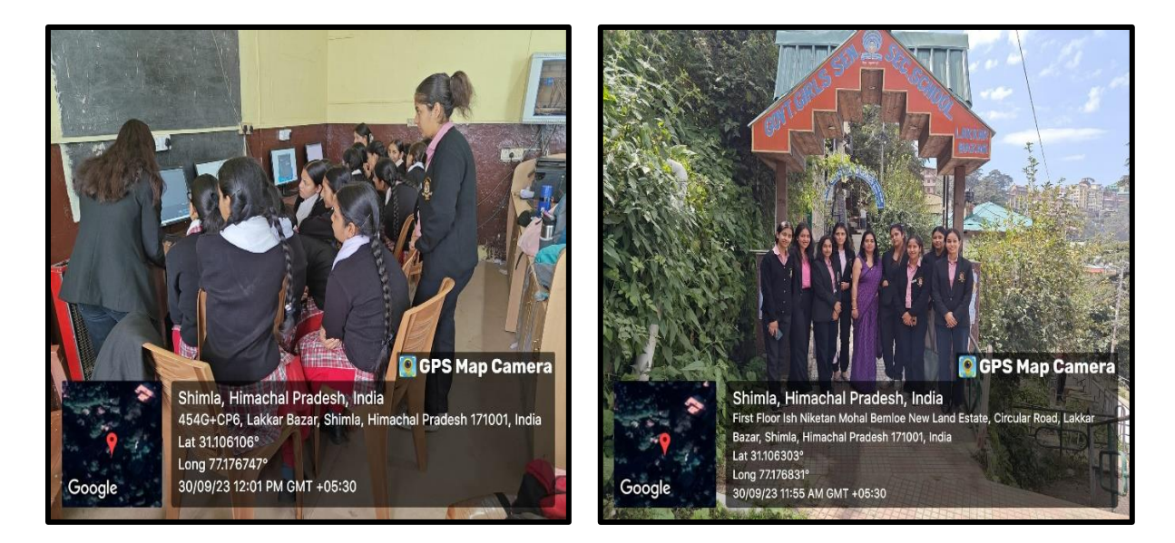
Workshop on "HTML & CSS WITH VS CODE" for School Students (September 30, 2023)