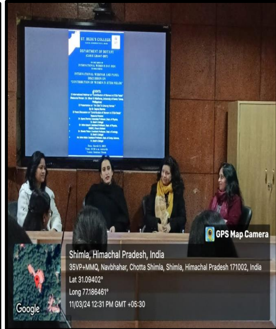
International Webinar on “Contribution of Women in STEM Fields” (11, March, 2024)