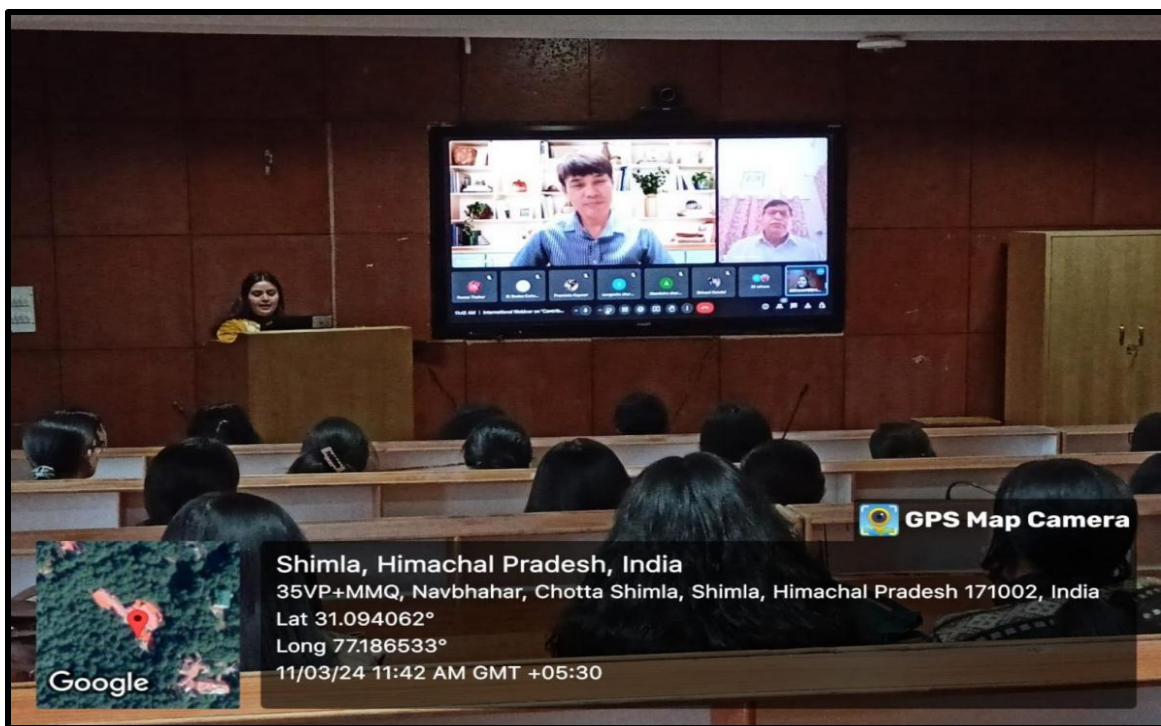
International Webinar on “Contribution of Women in STEM Fields” (11, March, 2024)