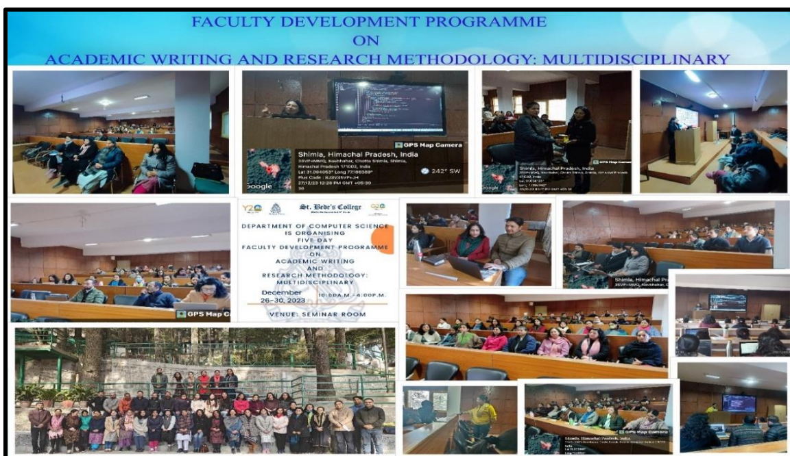
Five Days Faculty Development Programme on “Academic Writing and Research Methodology: Multidisciplinary” (December 26-30, 2023)