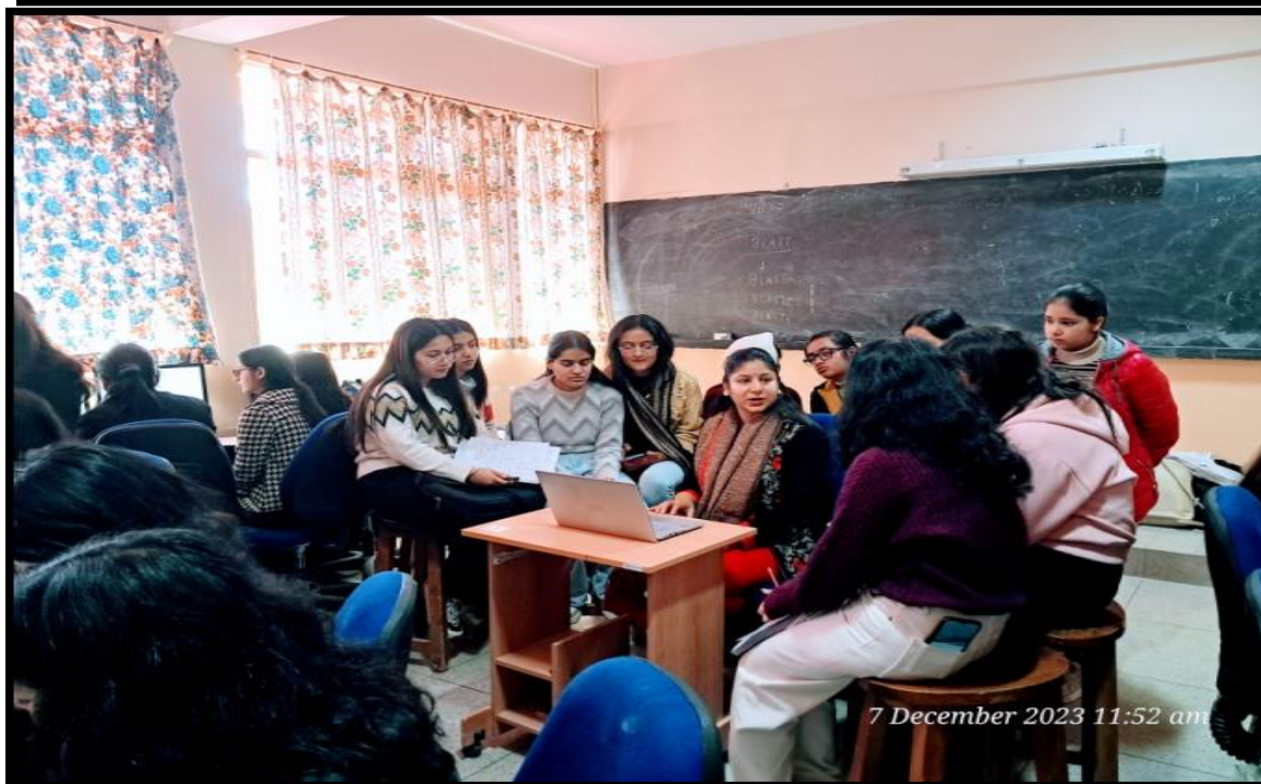
Workshop on 'Hand's on Training in Molecular Biology and Bioinformatics' (December 7, 2023)