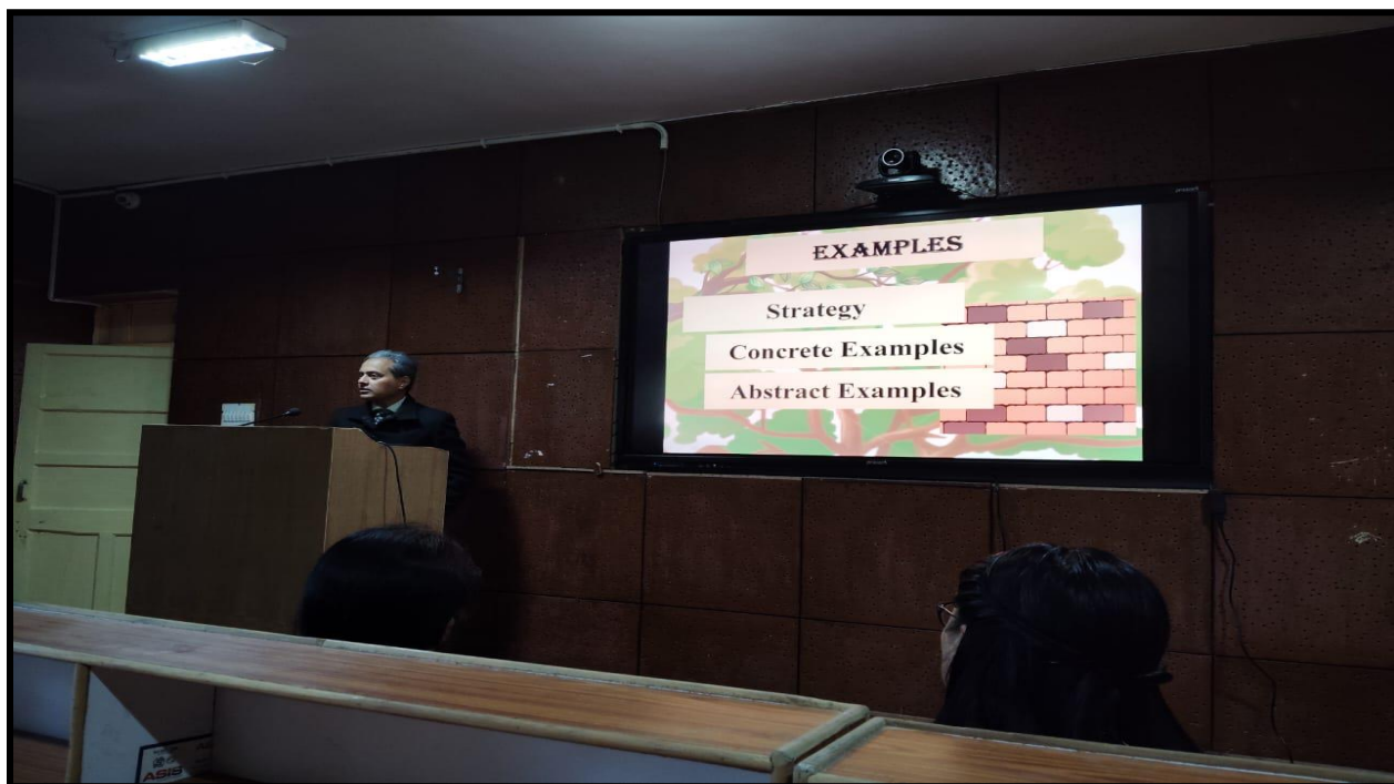
Workshop on 'Hand's on Training in Molecular Biology and Bioinformatics' (December 7, 2023)