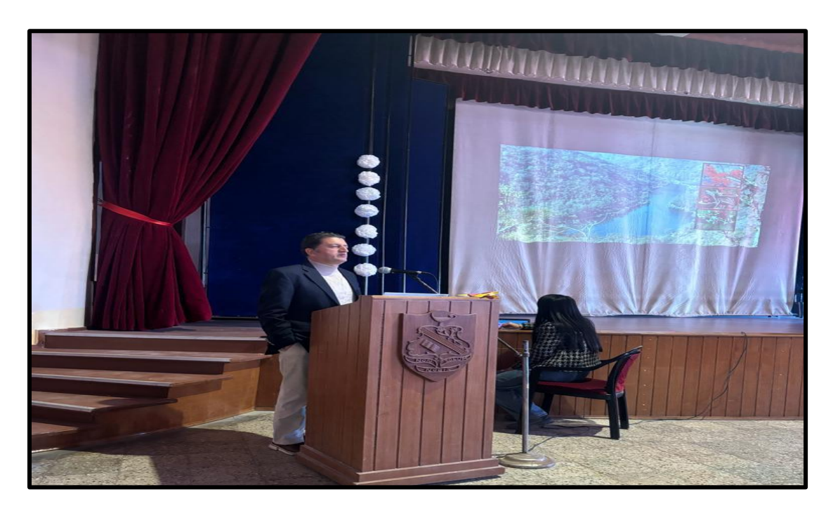
Guest Lecture on Traditional Ethnobotanical Knowledge of Native Plant Diversity from Himachal (29th November, 2023)