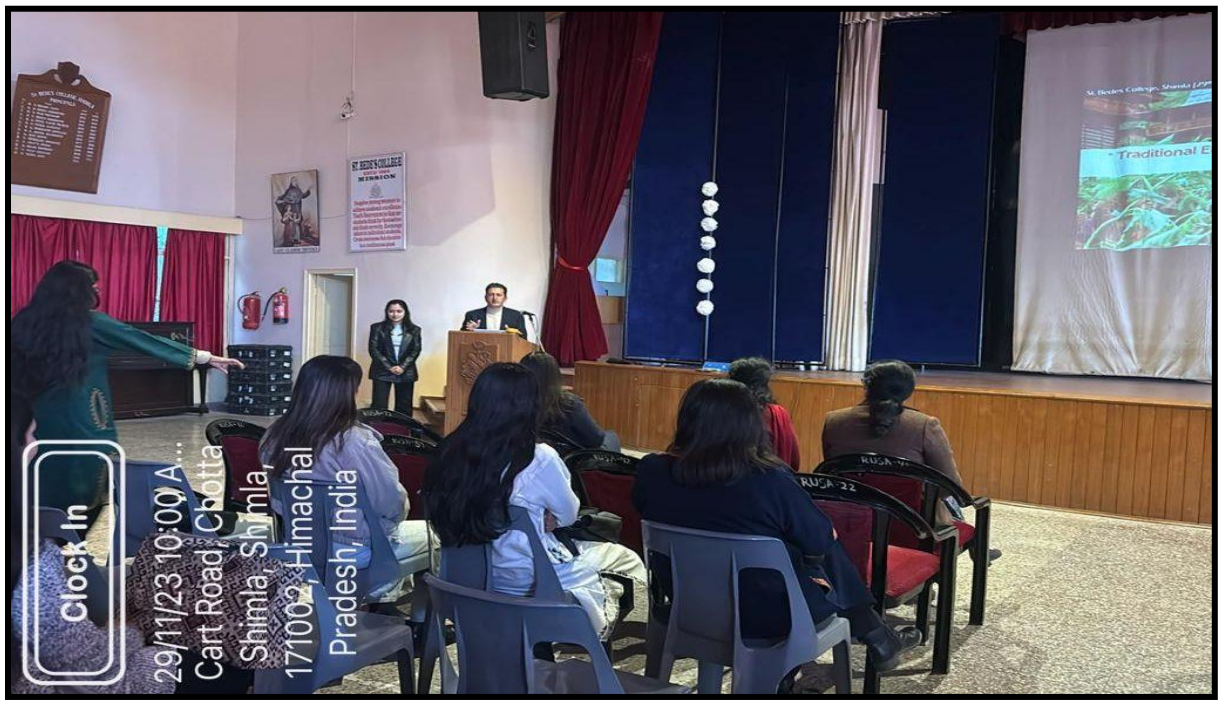
Guest lecture on Traditional Ethnobotanical Knowledge of Native Plant Diversity from Himachal Pradesh (29<sup>th</sup> November, 2023)