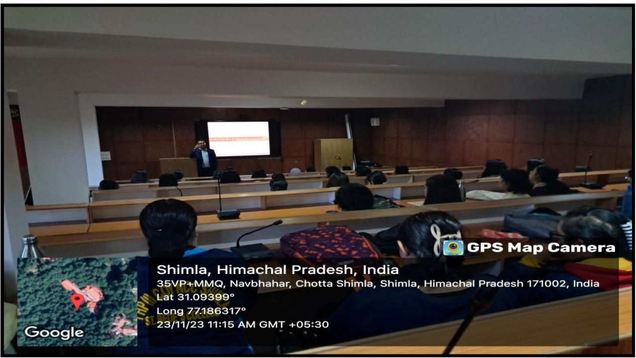
Career Counseling Session and Guest Lecture on 'Biotechnological Advancements and Career Opportunities (November 23, 2023)