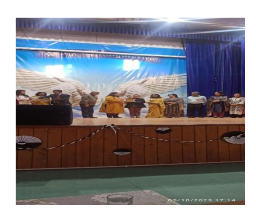
Students participating in various competitions