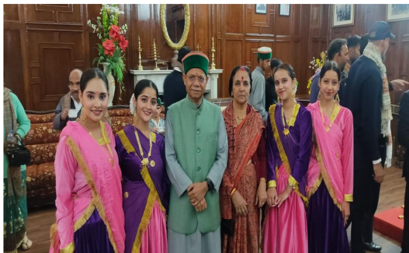
Students with Mr. Shiv Pratap Shukla ( Governor) and his wife