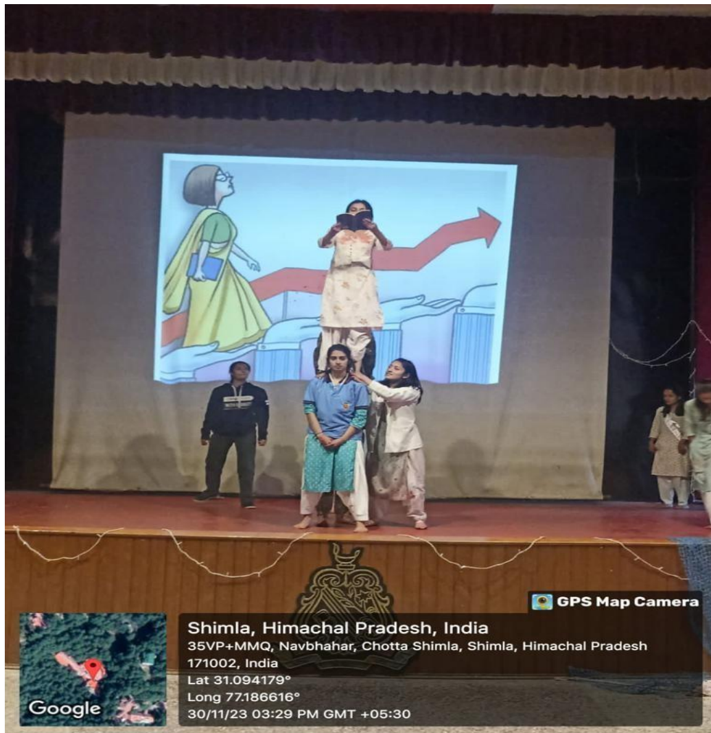
Students Performing Various Dances on the theme Women Empowerment