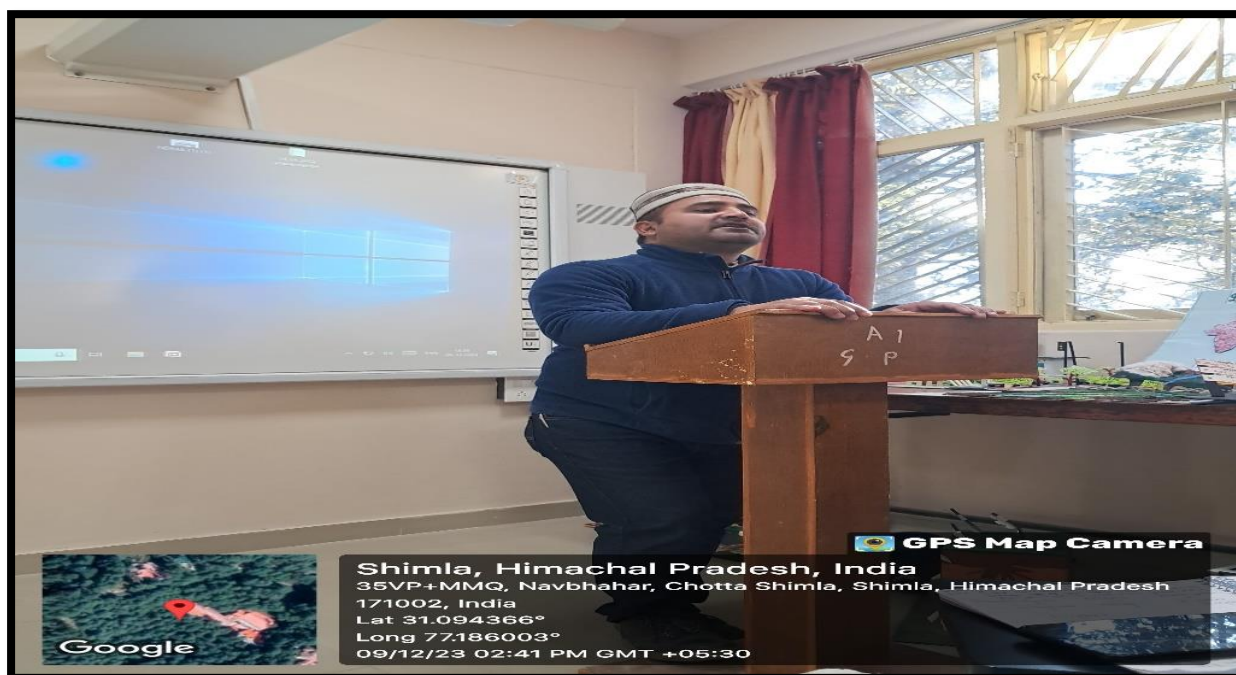
Awareness speech delivered by the Cell Convenor