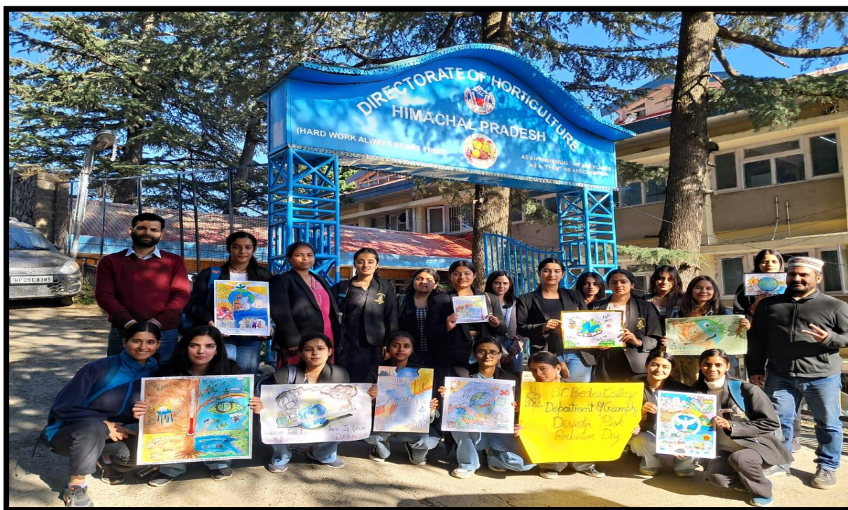
Awareness rally along with posters concluded at Directorate of Horticulture