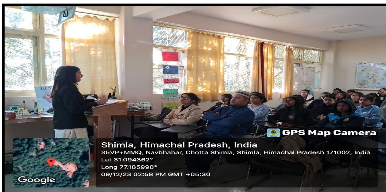
Presentation by the Vice-President of the Cell

Outcomes: -The session was quite interesting as it brought a lot of knowledge about our apex body who is responsible in regulating and managing disaster across the country. The session helped students a lot by answering their problems and queries regarding law and policy making, procedure, structure and functioning.