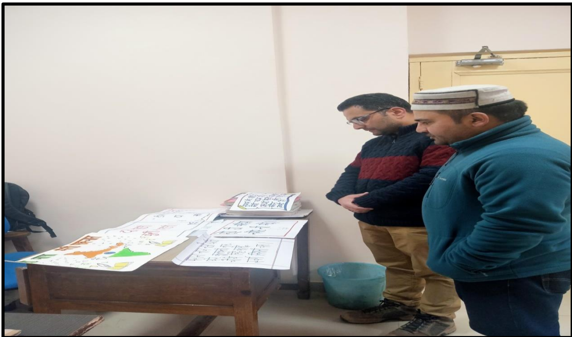
Judge of the event selected the best poster