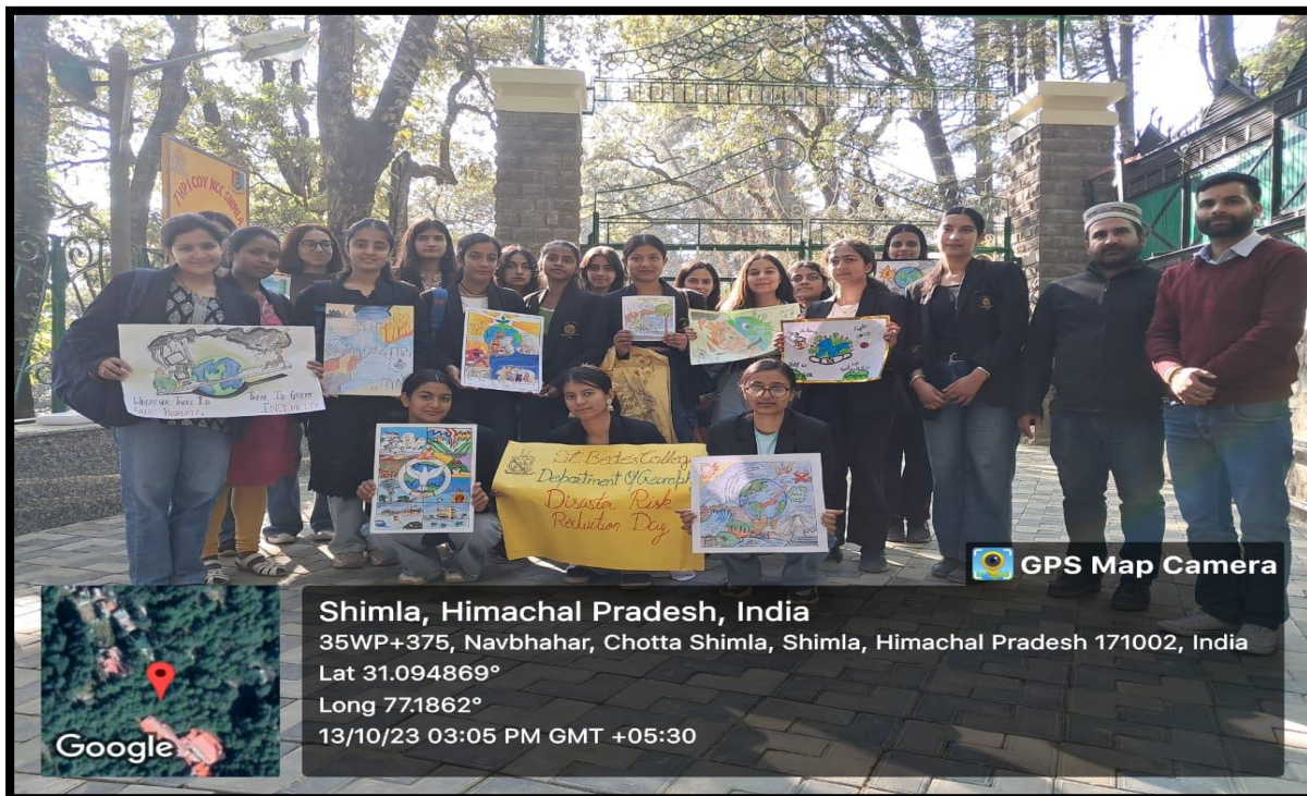
Students with posters