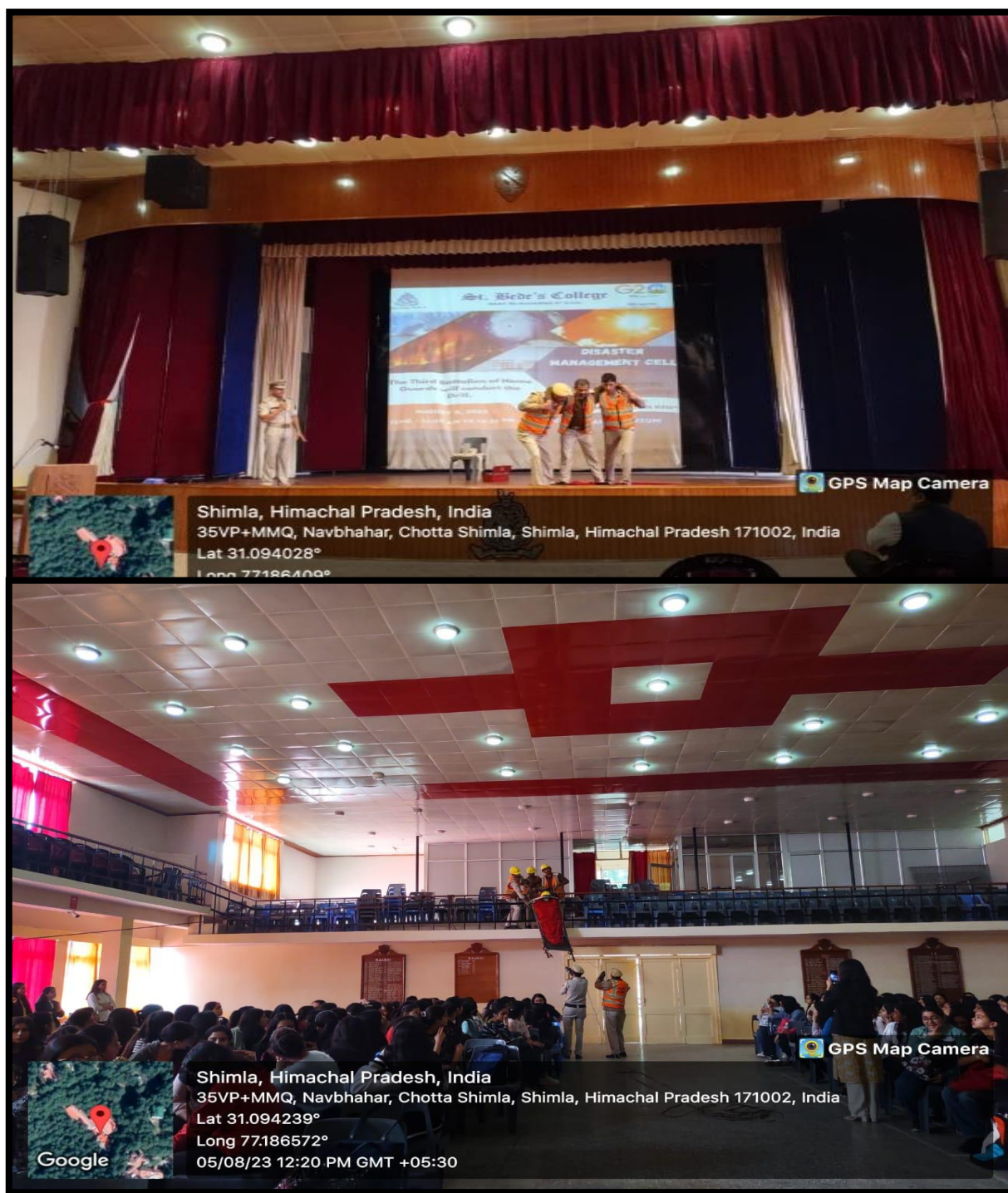
Glimpses of Mock drills