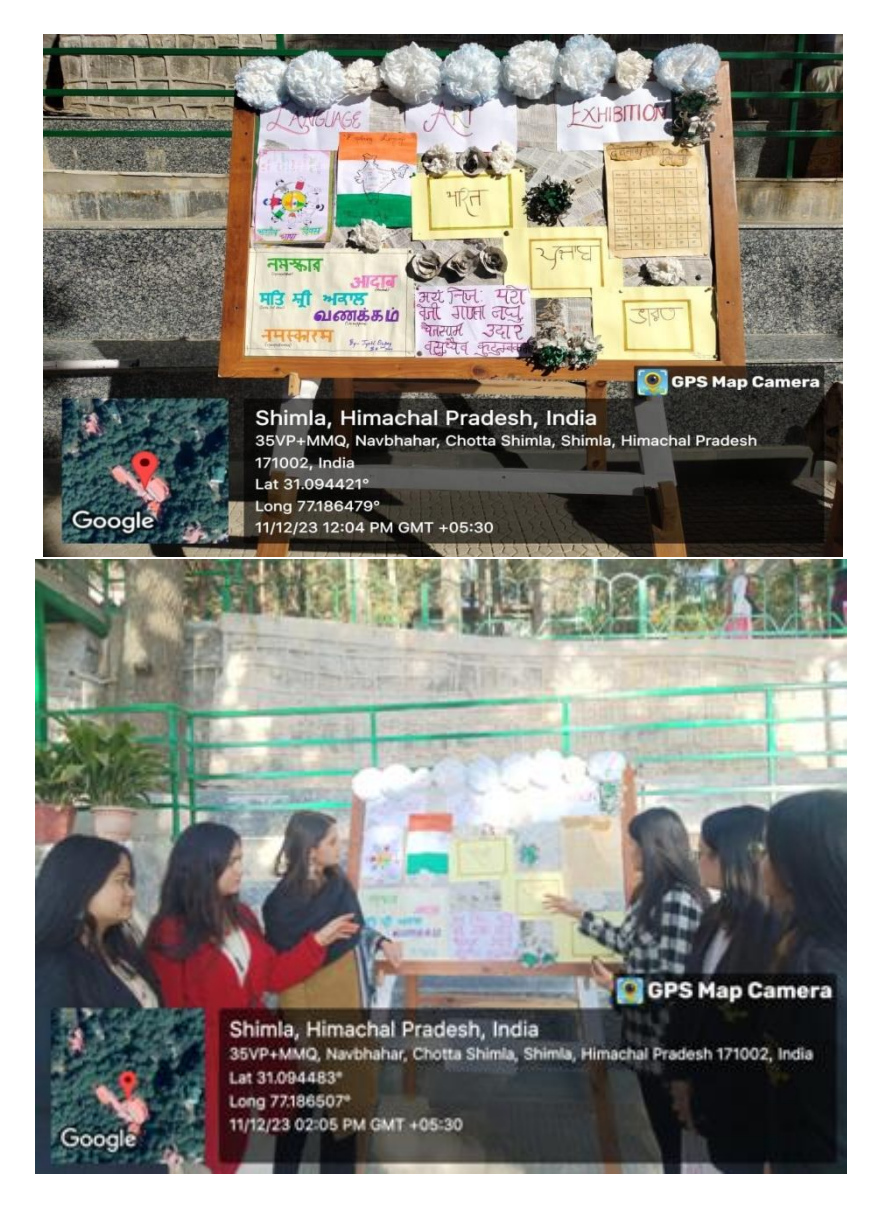
Artful Dialogues: Exploring Language through Art