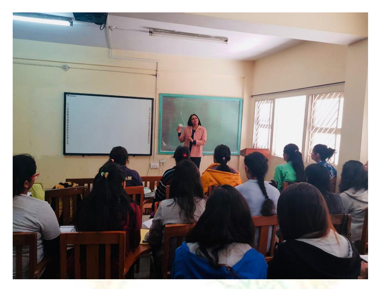
NATURE WALK FOR CREATIVE WRITING INSPIRATION

Objective: To connect PG students with the natural world and to inspire creativity and the development of descriptive writing skills.