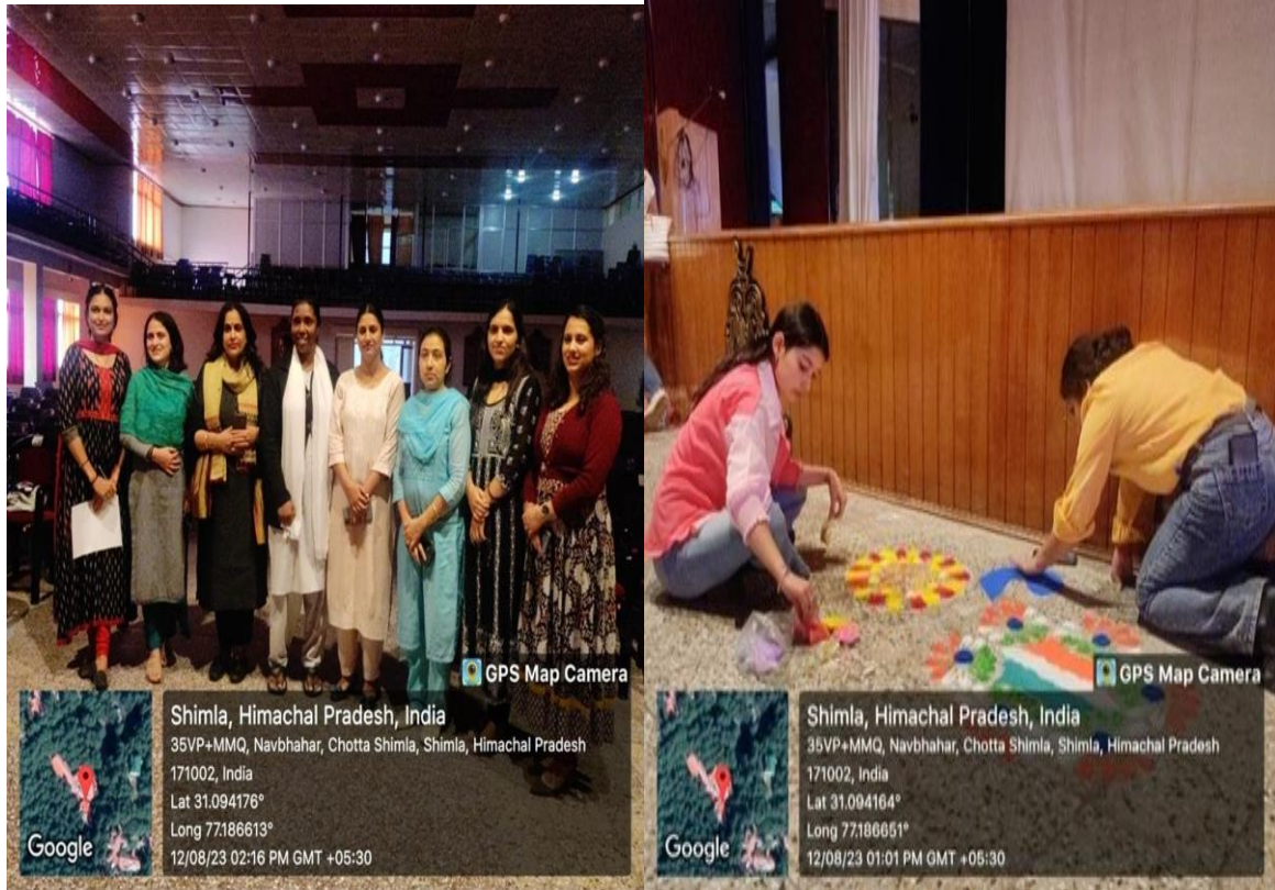
Inter-ship Rangoli Making Competition (August 12, 2023)

Ship MS CHIRAG St. Bede's College, Shimla