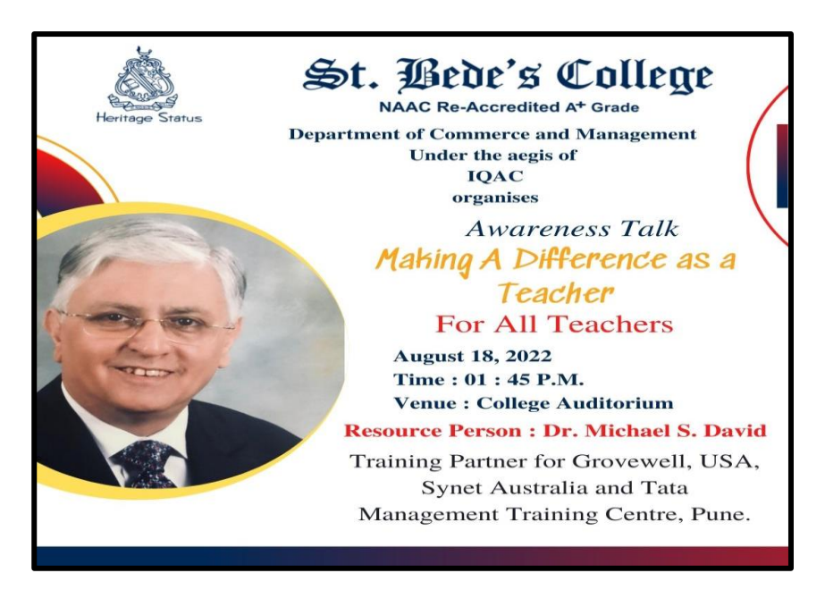
An Awareness Talk on August 18, 2022

Outcome- The faculty members found the awareness talk insightful and informative, and it provided them with an excellent opportunity to reflect on their teaching practices and explore innovative methods to engage their students. They appreciated the college authorities' efforts in organizing the event and expressed their desire for more such sessions.