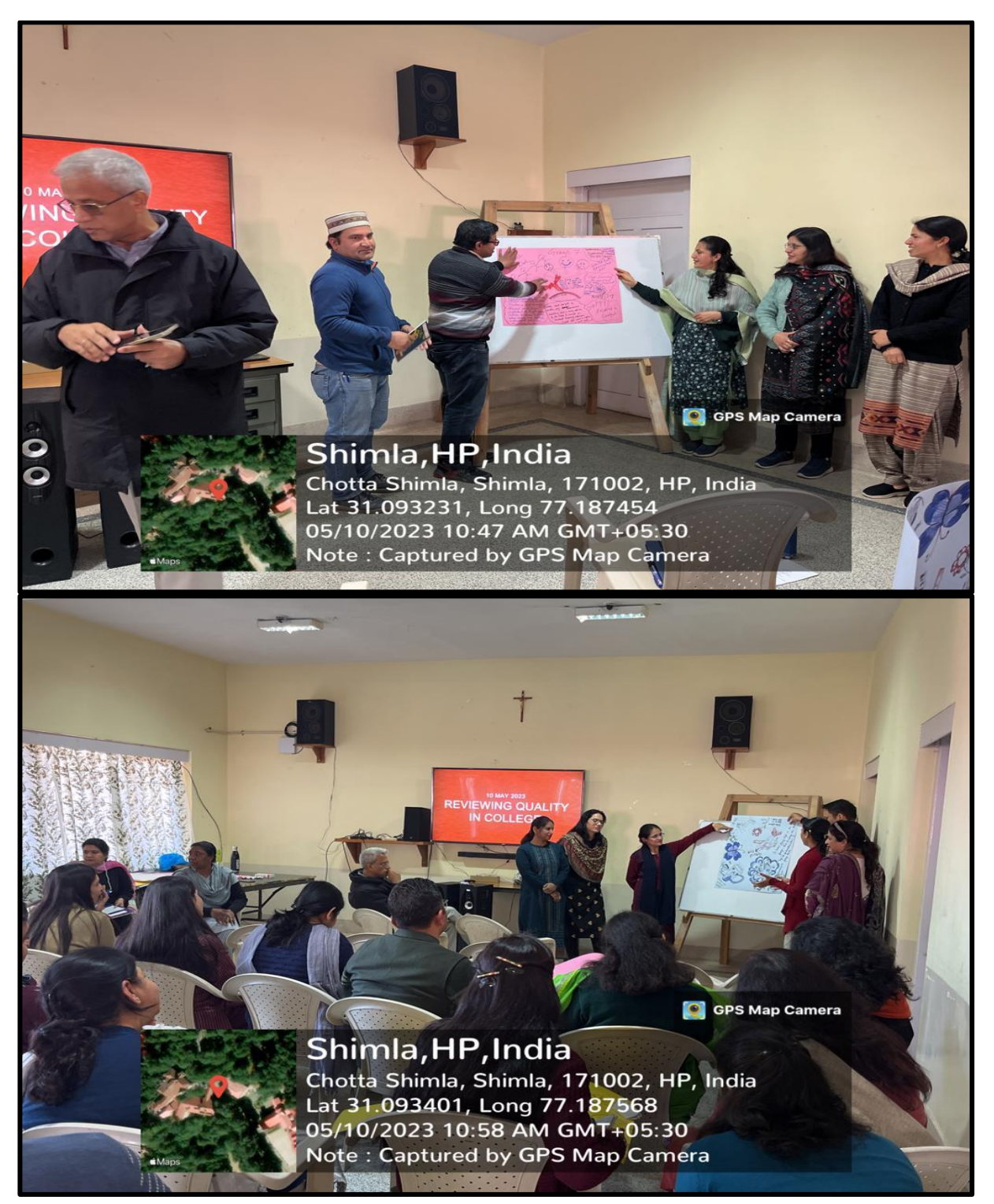
Faculty Development Programme on May 10, 2023