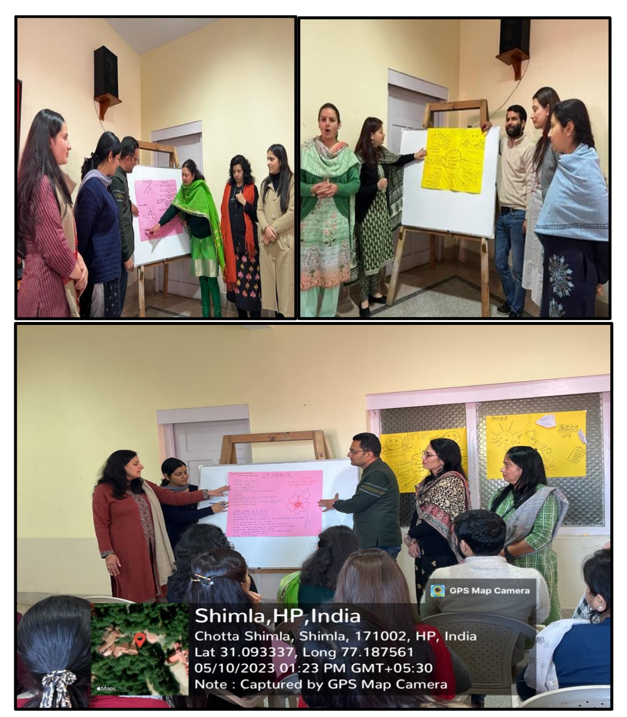
Faculty Development Programme on May 10, 2023