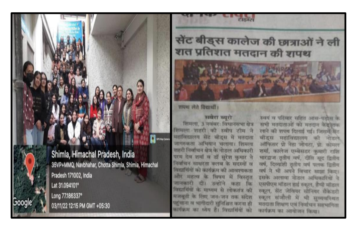
An Electoral Awareness Session on November 03, 2022

On November 03, 2022, the Electoral Literacy Club of St. Bede's College organized an electoral awareness session with the State Nodal Officers as chief speakers. Objective: The objective of the session is pointed towards the youth's role in transforming the political system. During the session, the Chief Nodal Officers engaged in a discussion with the students from the Department of Political Science, focusing on the youth's role in transforming the political system. Outcome: The students actively participated in the discussion, shedding light on the negative impact of corruption, red-tapism, and horse trading in the country's political system. They also expressed their eagerness to exercise their voting rights in the upcoming legislative assembly elections. The nodal officers encouraged the students to raise awareness and motivate people to vote, emphasizing the importance of becoming active citizens of the country. The session was highly informative and ended with a pledge taken by all members to vote in the upcoming Assembly elections.