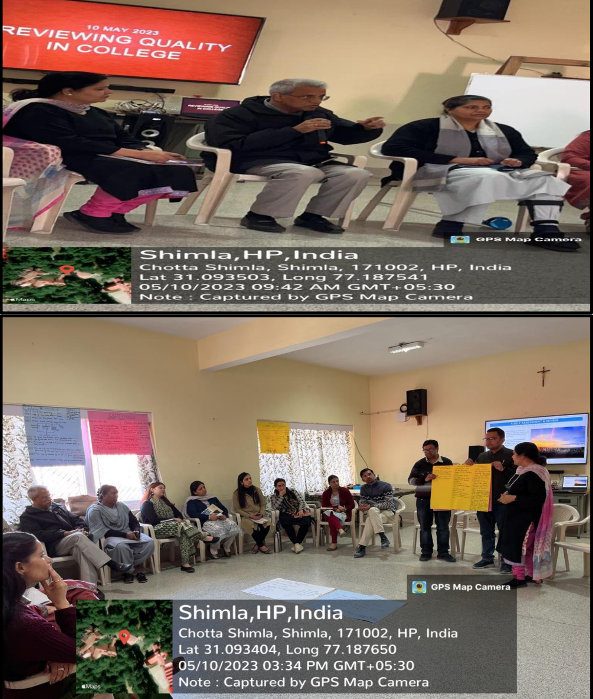
Faculty Development Programme on May 10, 2023