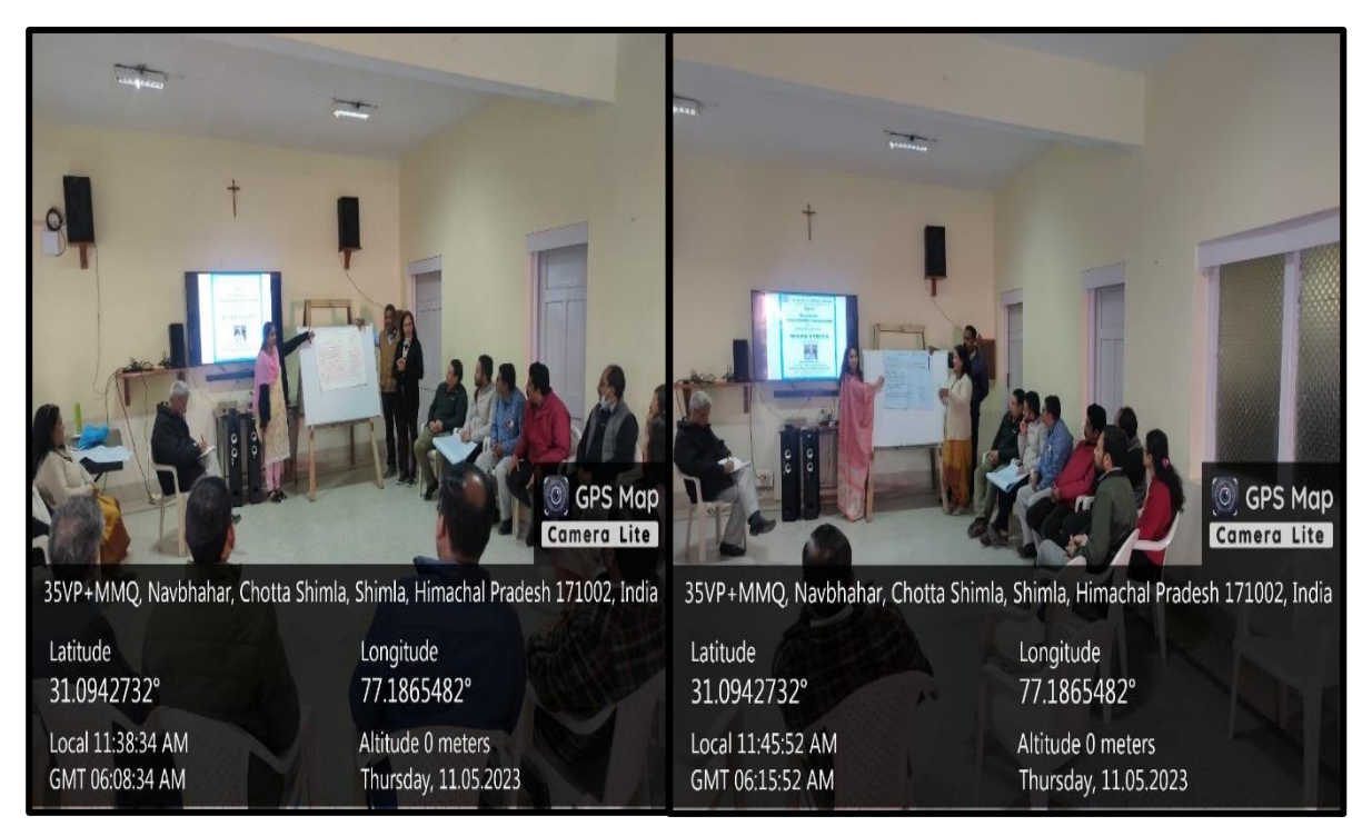
Development Program on 'Work Ethics' for the Non-Teaching Staff on May 11, 2023