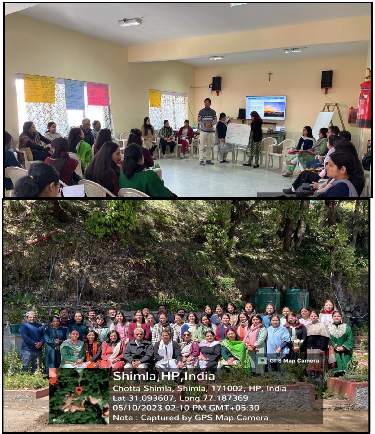
Faculty Development Programme on May 10, 2023