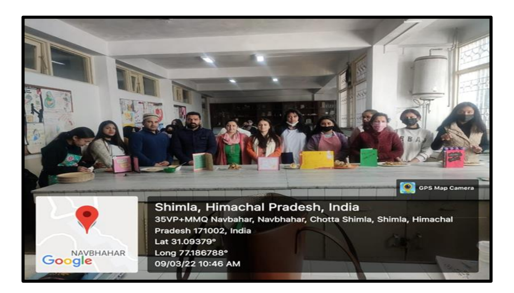
"Let food be thy medicine, thy medicine shall be thy food."

The event encouraged participants and attendees to incorporate traditional foods into their daily lives, promoting a healthier lifestyle and fostering a sense of pride in cultural heritage. It served as a platform for cultural exchange and appreciation, as individuals from diverse backgrounds shared their traditional recipes and learned from one another.