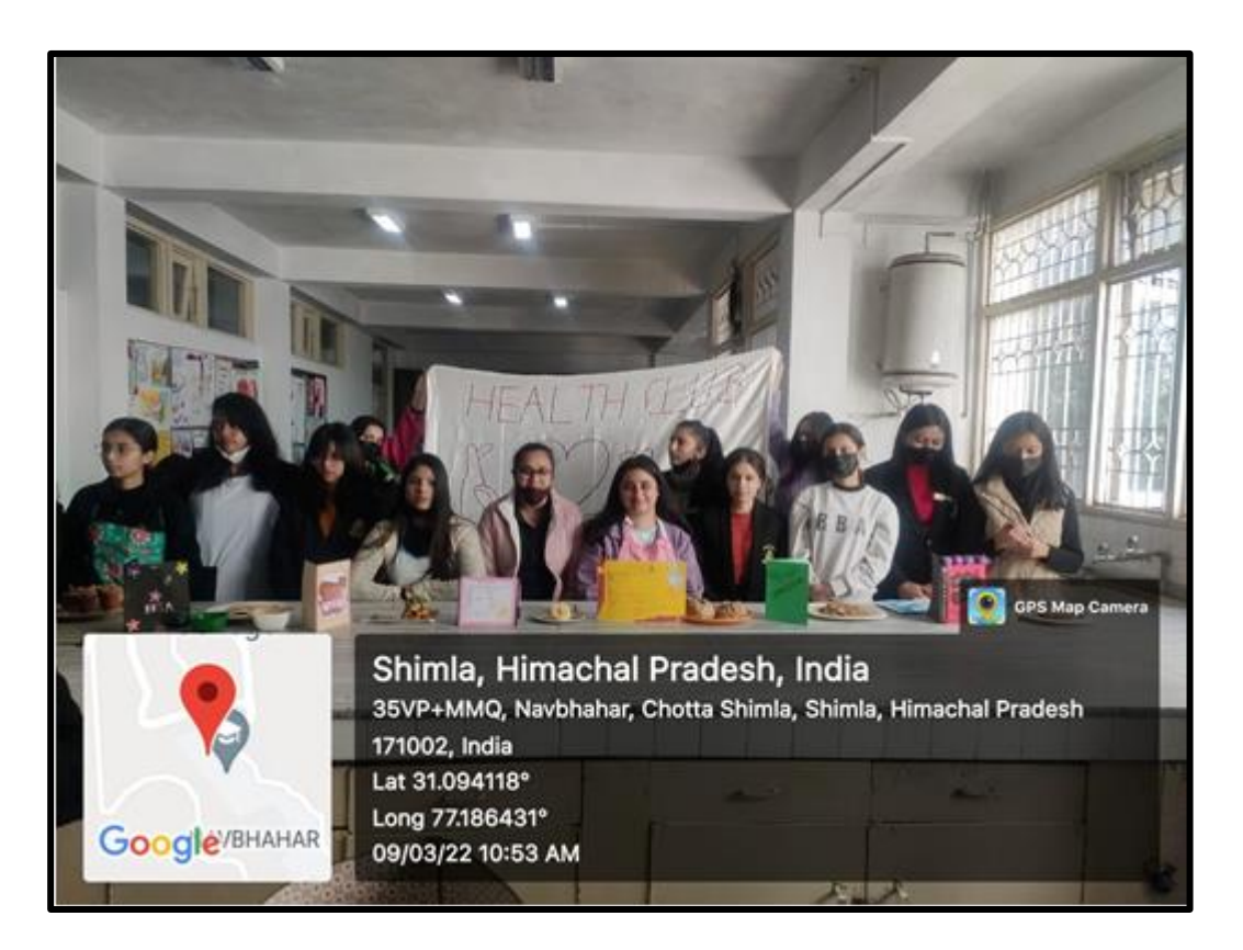
Students displaying traditional dishes and explaining their health benefit