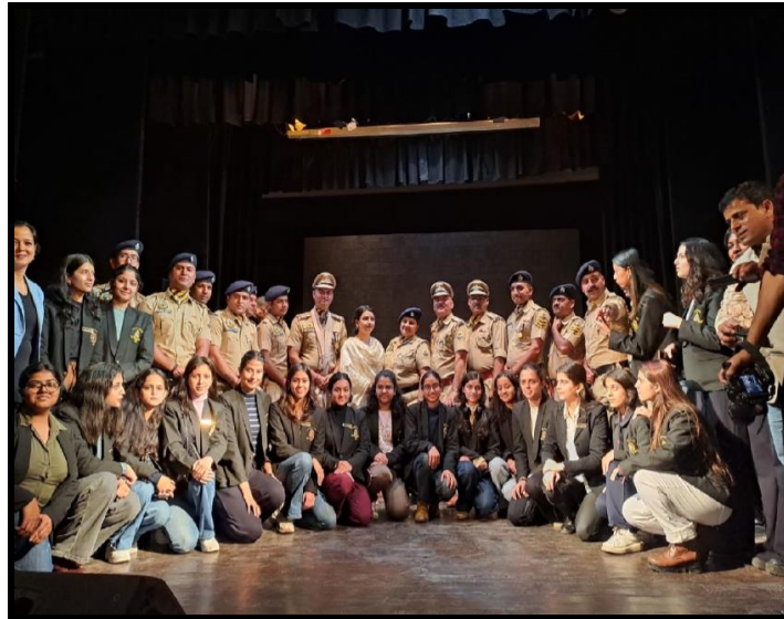
Electoral Literacy and Awareness Campaign