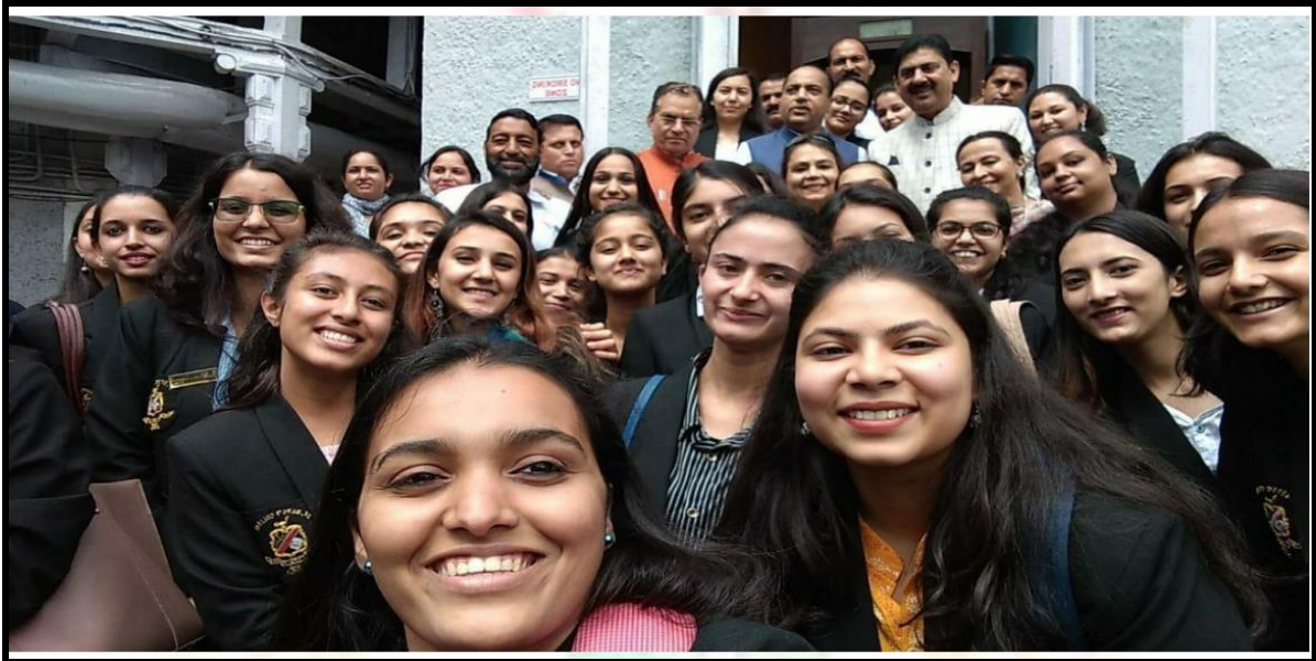
Educational Visit to Vidhan Sabha