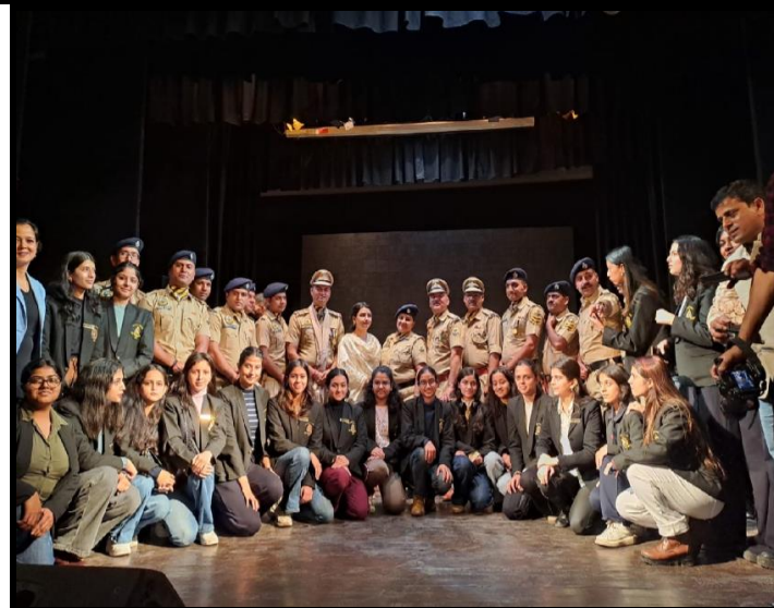
Electoral Literacy and Awareness Campaign