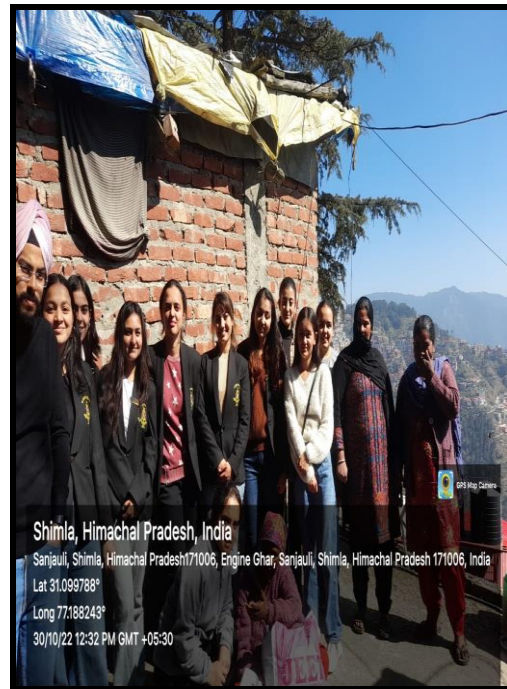
Clothes Donation Drive