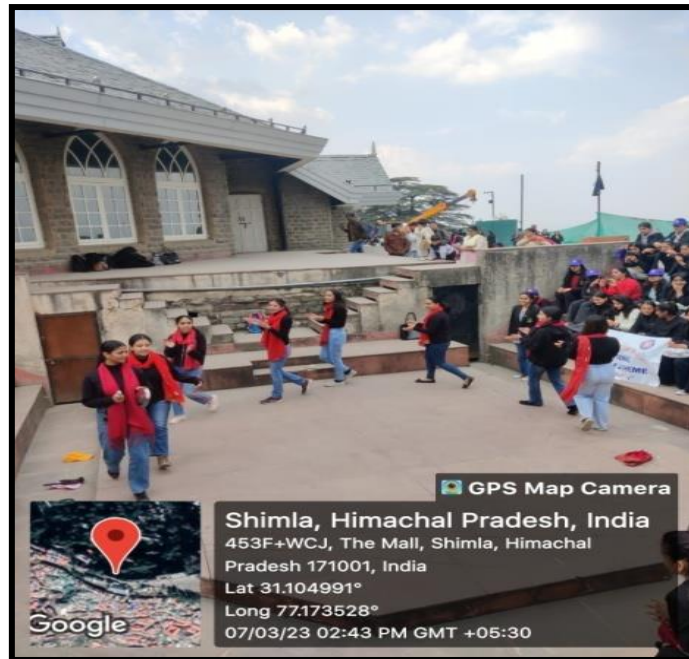
Students of Debates & Dramatics Society Performing in the “Nukkad Natak”