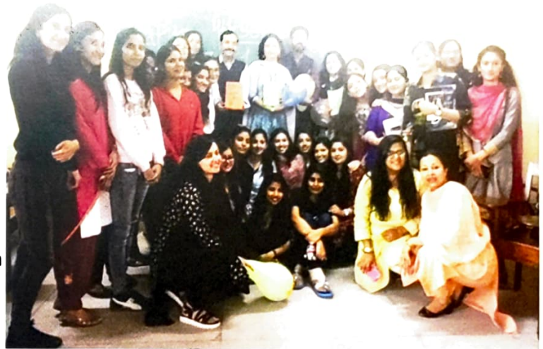
The Department of English Celebrates Teachers Day