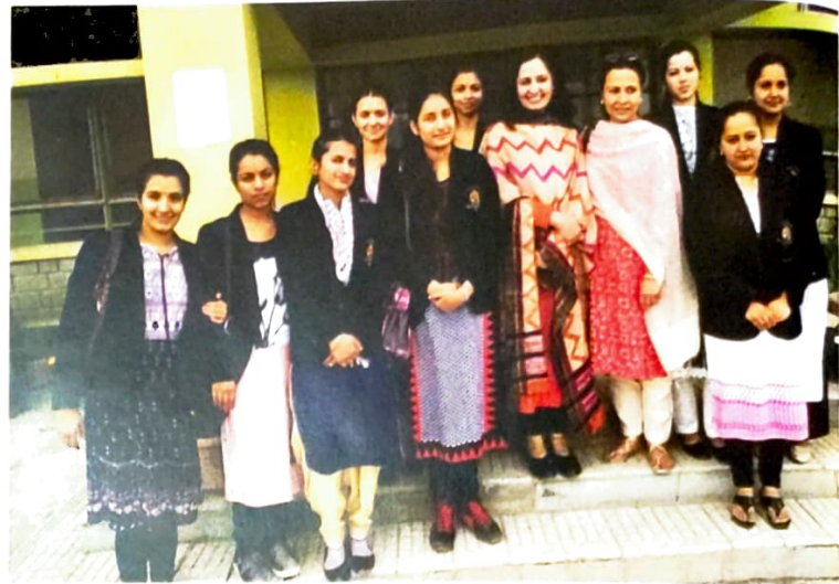
Inter-Disciplinary Activity Environment Awareness at Govt. College Theog