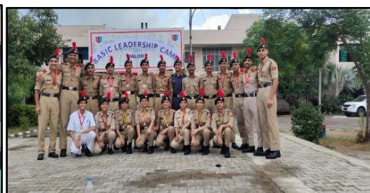
Basic Leadership Camp