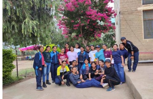
Cadets in group photograph