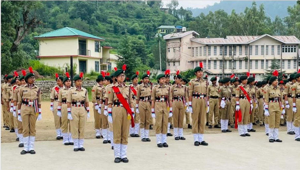
Cadets during the Drill competition