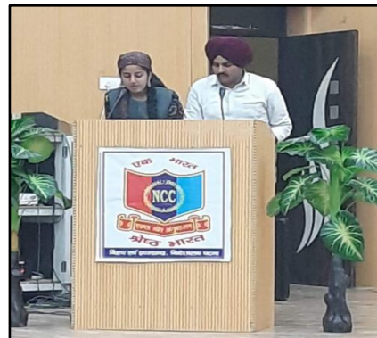
Cadets during the Camp