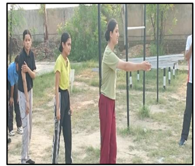
Advance Leadership Camp at Malout