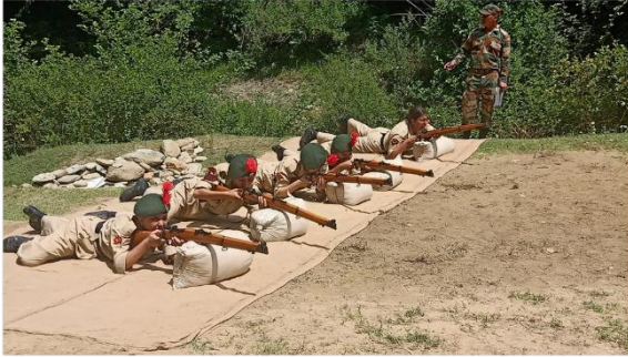
Cadets in firing range