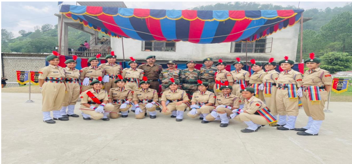
Group photograph with the commanding officer

From 12th July, 2022 to 21st July, 2022, 23 cadets participated in the Combined Annual Training Camp 225 held at Karsog. They secured first position in Drill, Group Singing, Group Dance, Firing, volleyball match and second position in Line Area, and assembling of INSAS rifle.