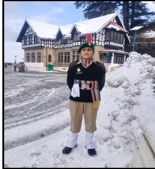
Republic Day Parade, Shimla