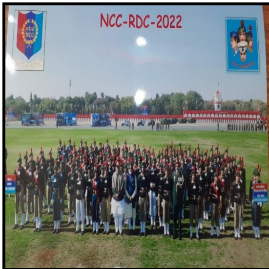
Republic Day Parade, New Delhi