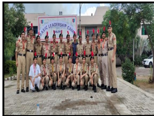
Basic Leadership Camp