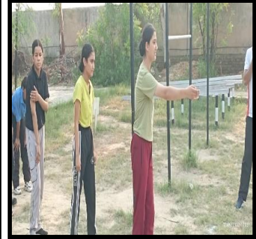
Advance Leadership Camp