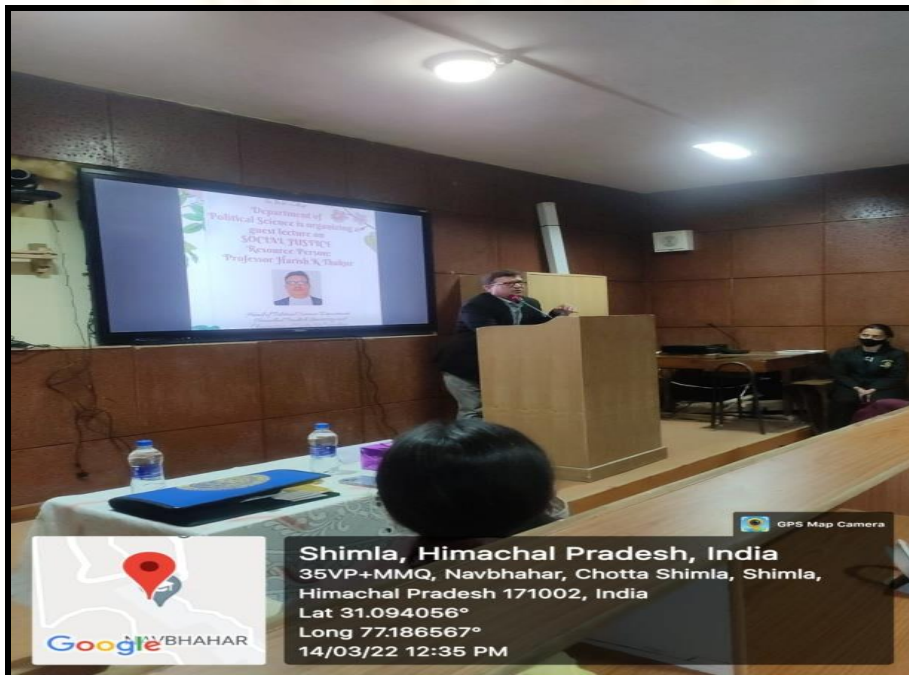
Lecture on Social Justice, Department of Political science