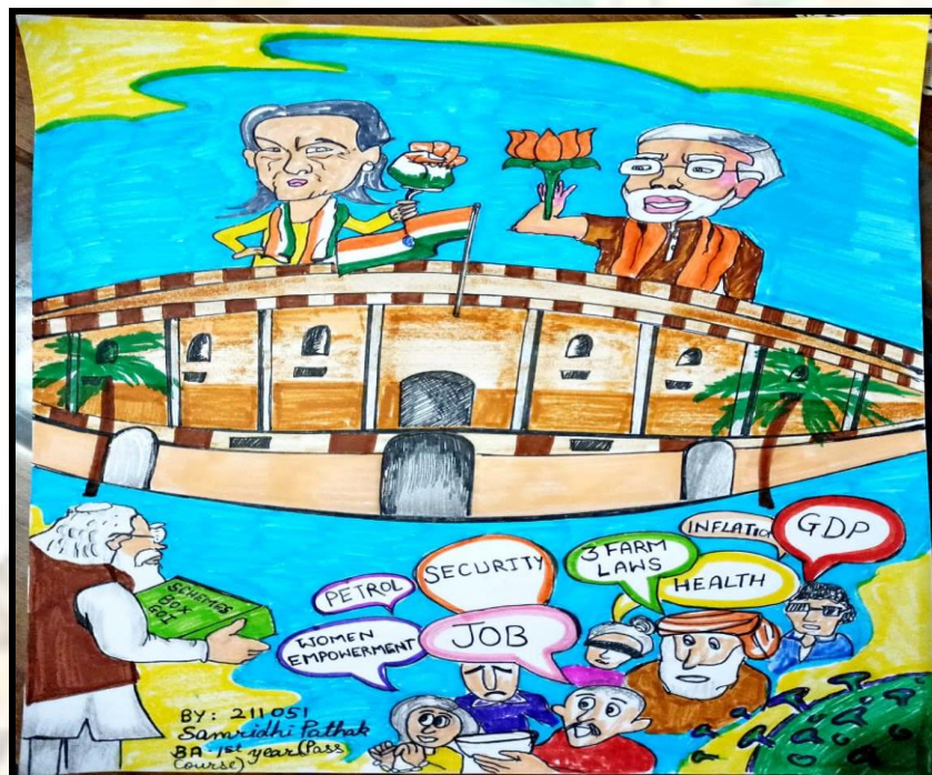
Cartoon Making Competition on the theme “Parliament of India”

The main purpose of the event was to make students aware of the constitutional values and to know the worth of having longest and most extensive Constitution in the world.