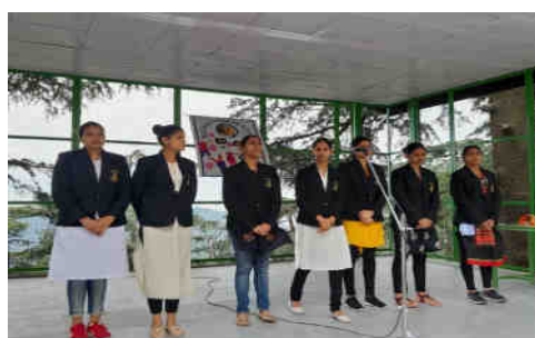
Govt. Sr.Secondary School, Portmore