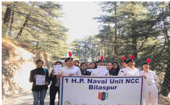
12 Cadets participated in Mass Awareness Cleanliness Rally