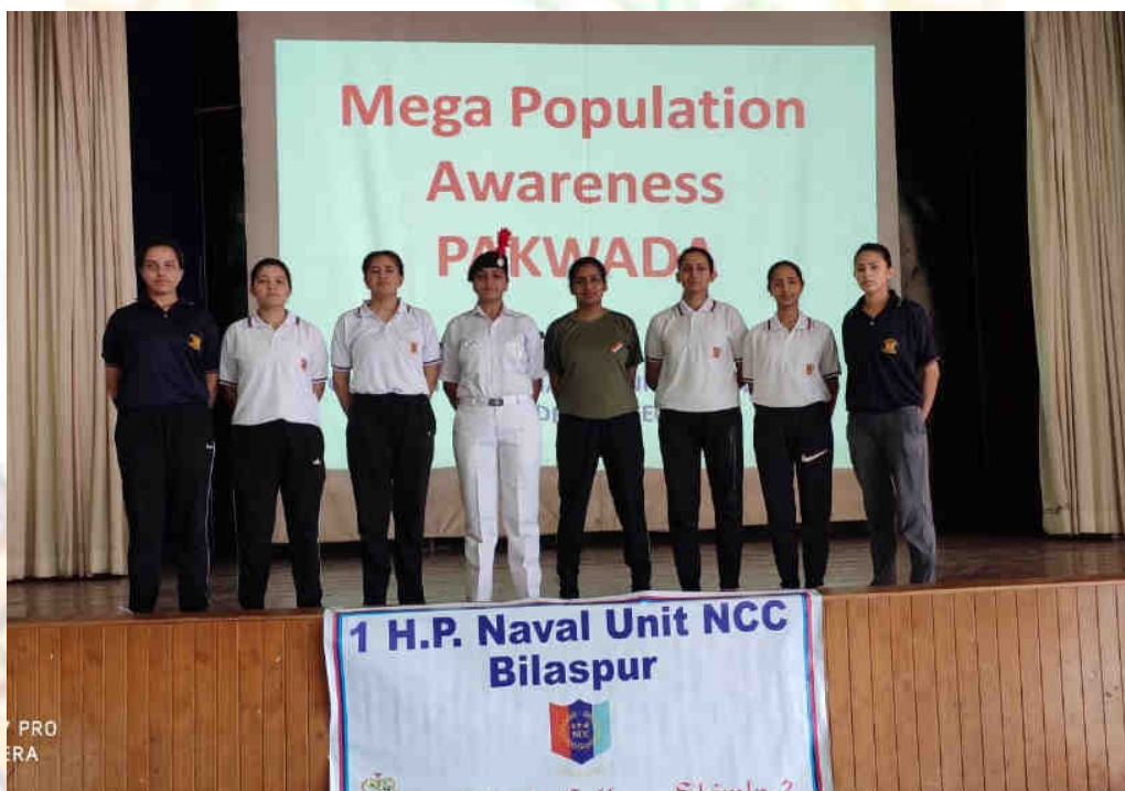
8 cadets participated in the “Mega Population Awareness Pakhwada”

The program ended with the quote, “It starts with one earth, with one awakening, with one person, with one choice, with one action with one initiative, with one community and with one mind.”