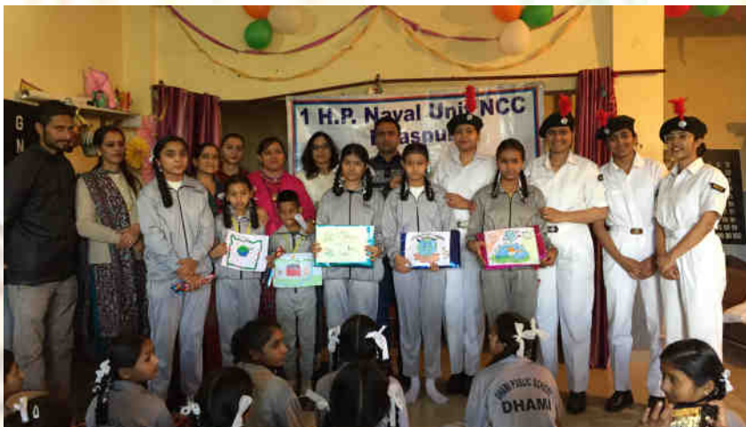
Volunteer Services offered by 4 Cadets at Dhami Public School

The cadets of 1HP NCC unit Bilaspur of St. Bede's College went to Dhami Public School to conduct a poster making competition on the topic "Clean India of my dreams ", The first three winners of the competition were acknowledged with gifts while the 4th 5th and 6th position holders were given chocolates.