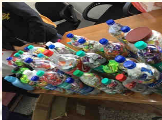
Polybrick Initiative Started by 20 Cadets in order to make Environment Clean

To promote the harmful effects of plastic disposal and around the cadets of St. Bede's college decided to collect plastic wrappers inside plastic bottles which could be used for making retaining walls. The Health Department and MC, Shimla acknowledged the efforts of the Cadets and entitled them as, "PIONEERS OF THIS GOVERNMENT INITIATIVE." The Chief Health Officer and the Commissioner (MC) highly appreciated the Cadets and invited them on 2nd October, 2019 at Ridge for felicitation.