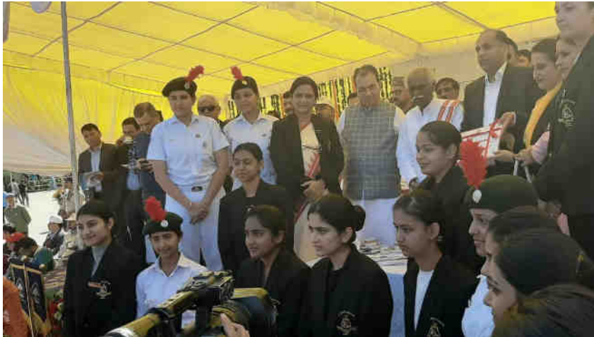
Cadets being felicitated by Hon'ble Chief Minister of HP - Shri Jairam Thakur.