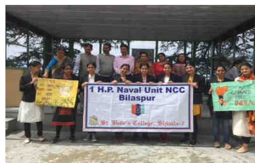
Govt School Bhrari.