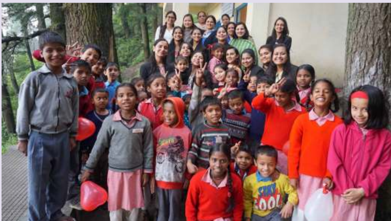
Community outreach at Govt. Primary School, Shimla