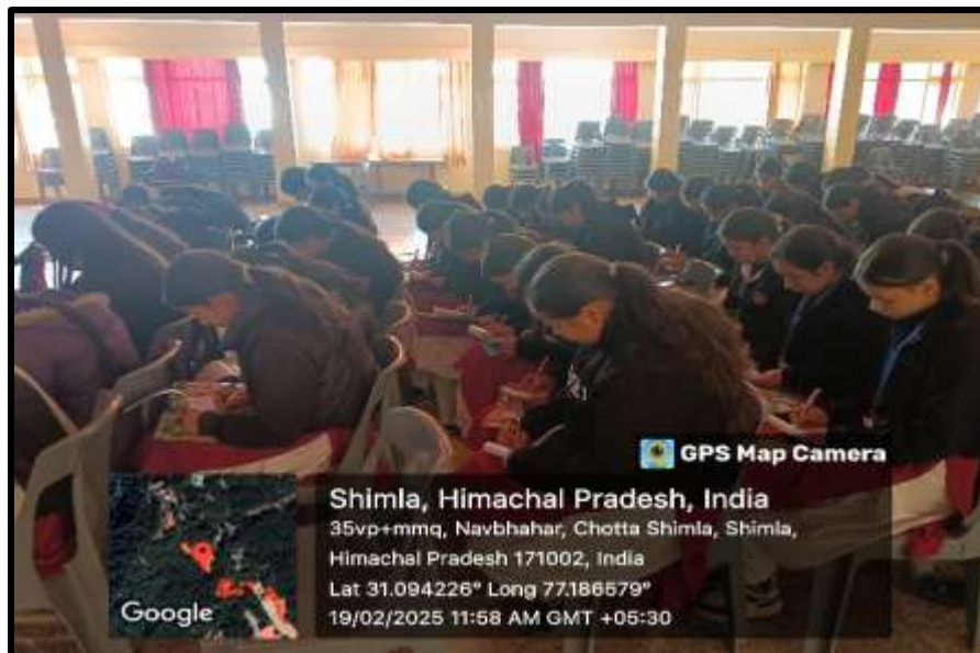
Workshop on " Promoting Intergenerational Bonding With College Students (February 19, 2025)