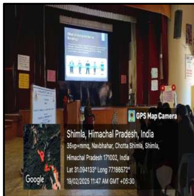
Workshop on " Promoting Intergenerational Bonding With College Students (February 19, 2025)