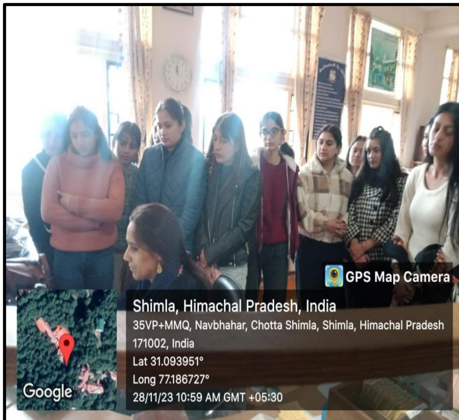
Students attending workshop conducted on INFLIBNET