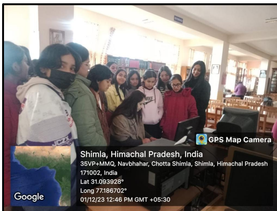
Students attending workshop conducted on INFLIBNET