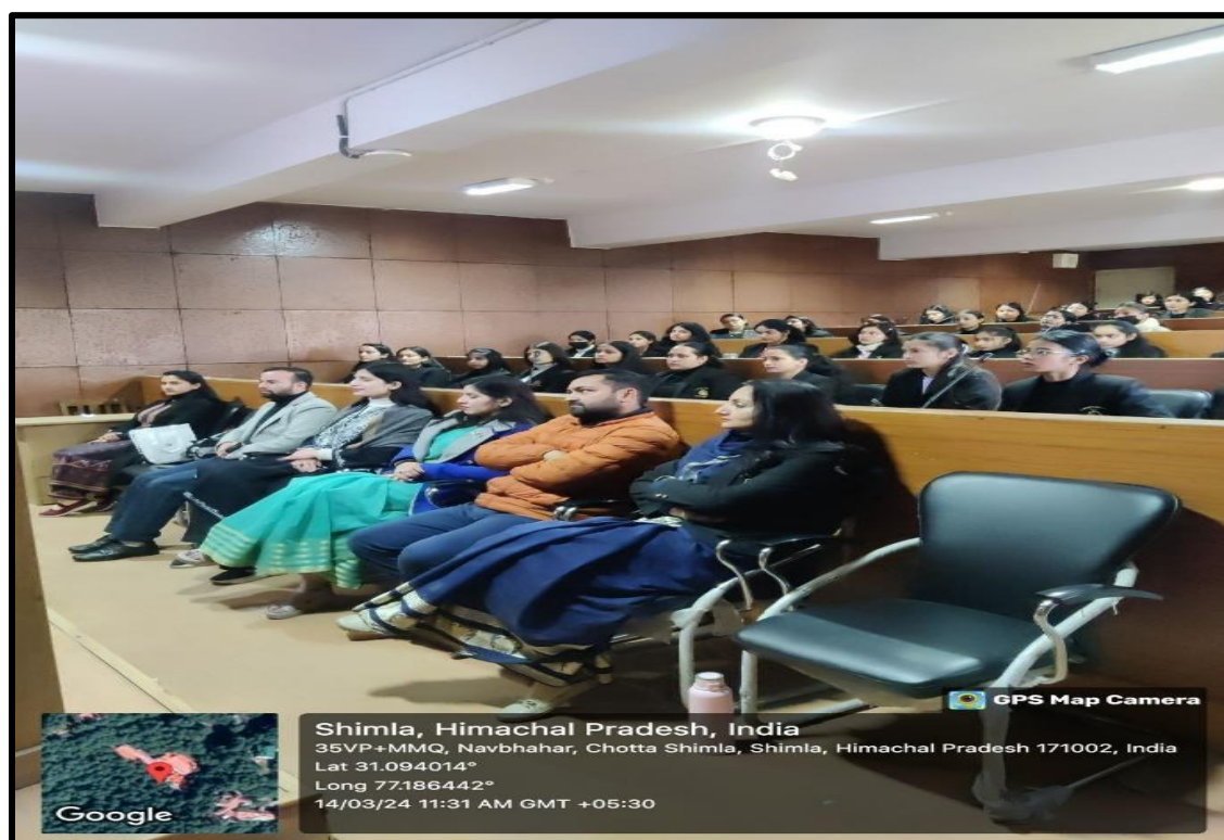
Campus Internship and Placement Drive (March 14, 2024)