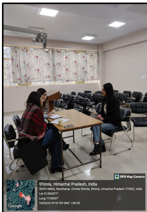
Campus Internship and Placement Drive (March 14, 2024)