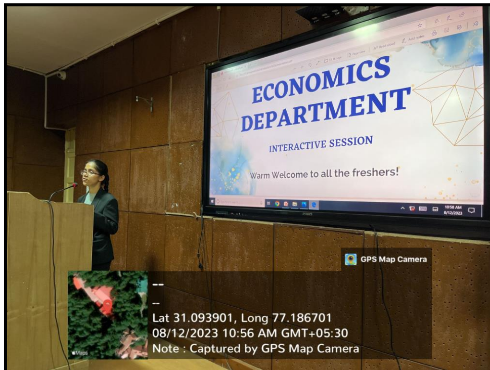
Students' Orientation (Department of Economics) (Sample)