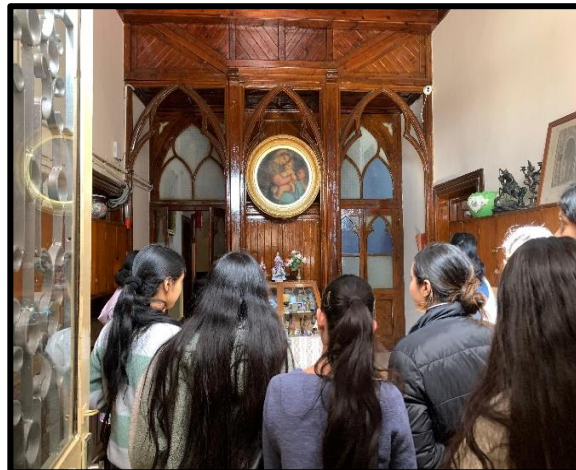
Students During the Campus Tour (Department of English)