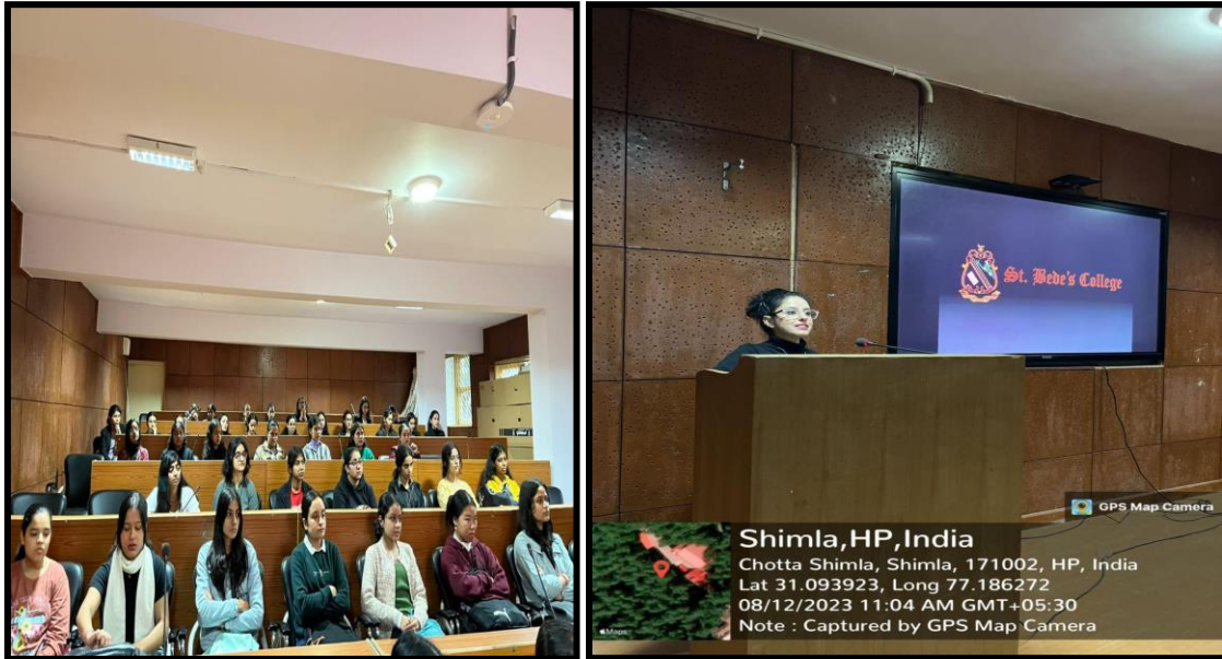
Students' Orientation (Department of Economics) (Sample)