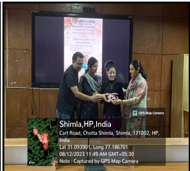
Students' Orientation (Department of Economics) (Sample)