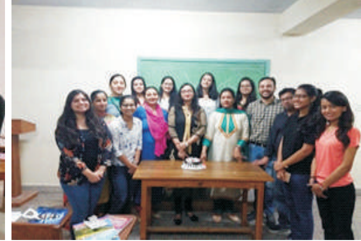
Department of Commerce