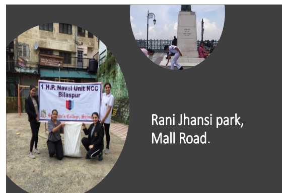
Rani Jhansi park, Mall Road.