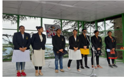
Govt. Sr.Secondary School, Portmore