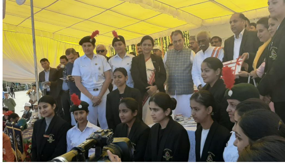
Cadets being felicitated by Hon'ble Chief Minister of HP - Shri Jairam Thakur.