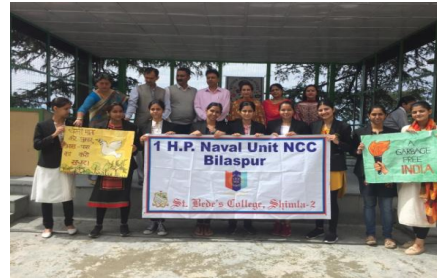
Govt School Bhrari.